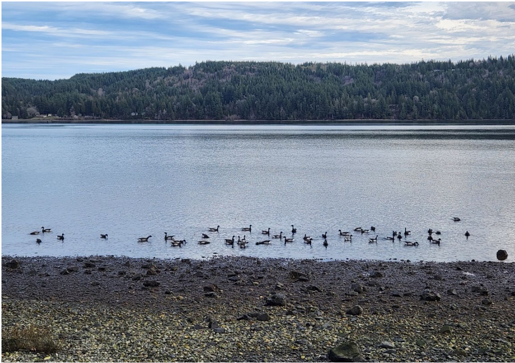
A flock of brant geese foraging nearby during the site visit.

February 3 – No-Anchor Zone buoy line and anchor maintenance along the Port Townsend waterfront