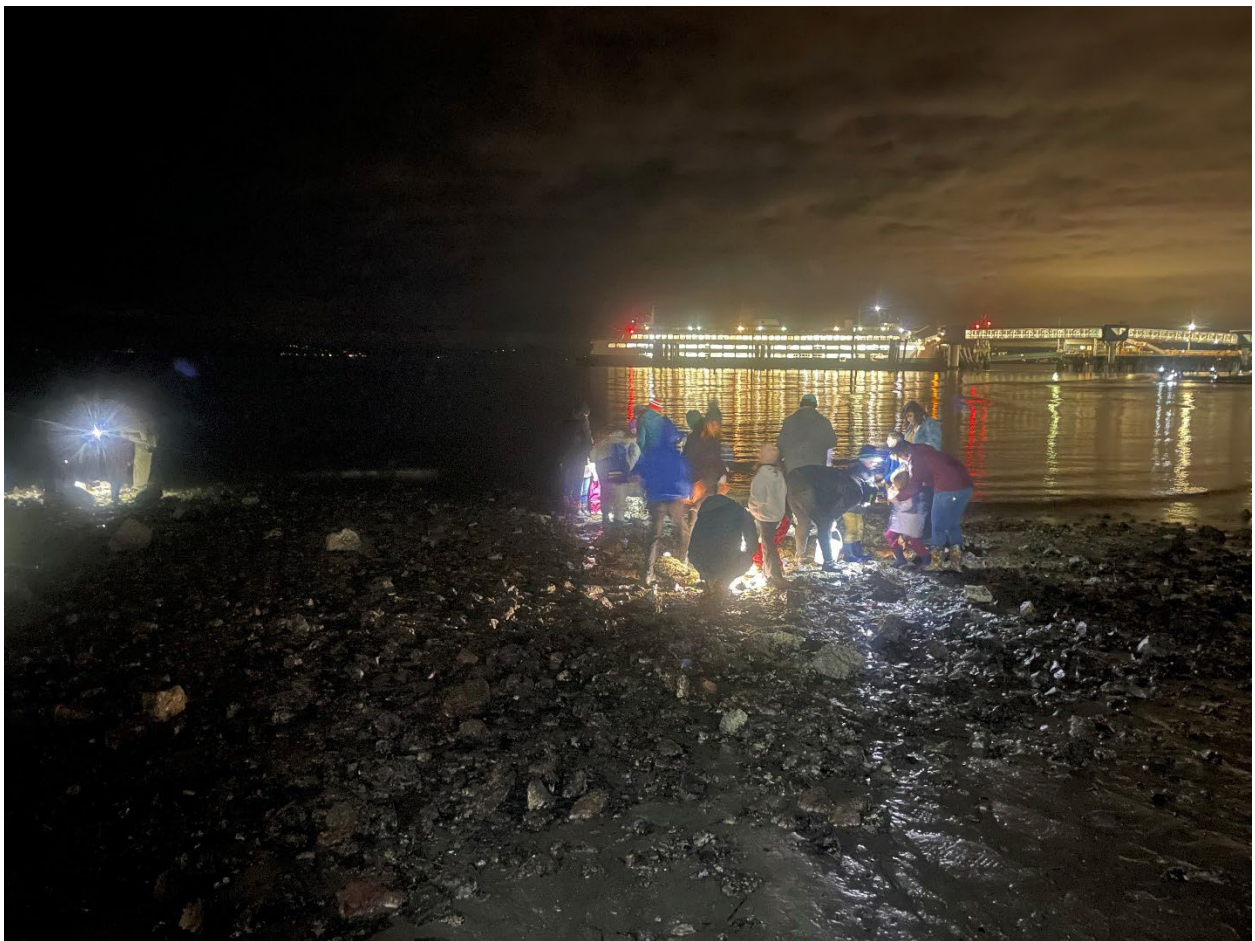
Starlight Beach Walk.

Photos (photos of recent projects or members—include project, photo credit and additional info):