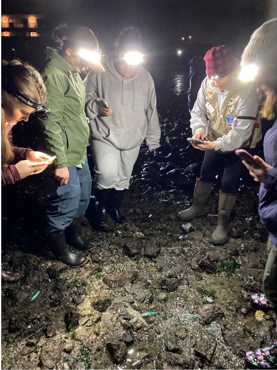
Starlight Beach Walk.