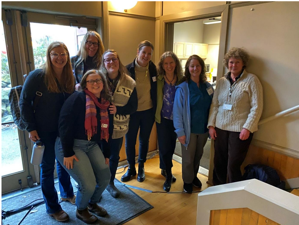
Members of the San Juan Stewardship Network representing their organizations at Storming the Sound conference

Photos (photos of recent projects or members—include project, photo credit and additional info):