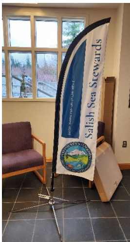
New Salish Sea Stewards Banner