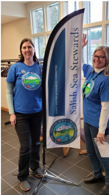
Salish Sea Stewards New Banner