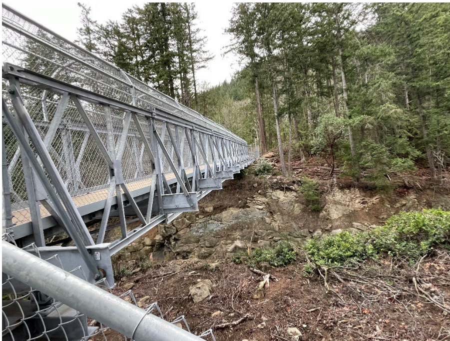
Newly installed bridge to safely cross the railroad tracks at Clayton Beach.