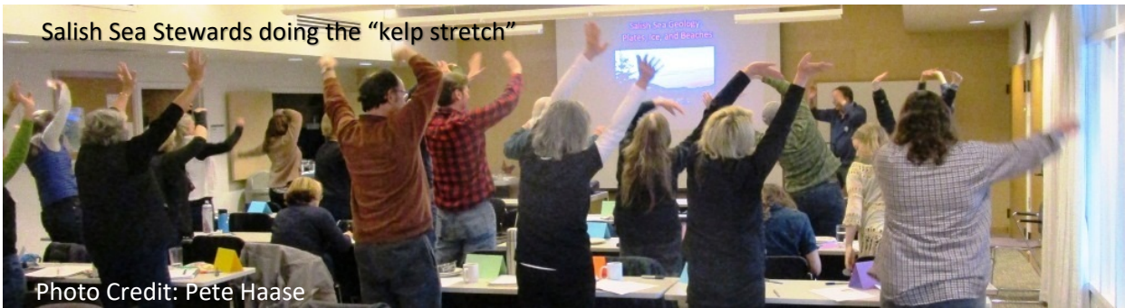
Salish Sea Stewards doing the "kelp stretch"