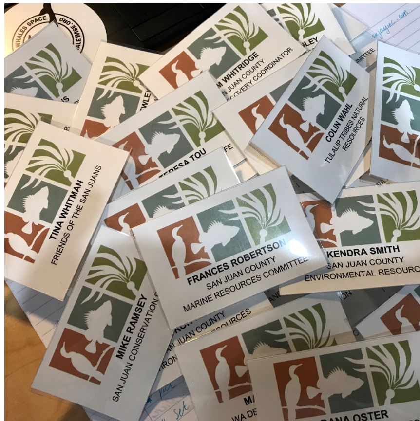
A pile of name tags ready for the Marine Managers Workshop.

Photos (photos of recent projects or members—include project, photo credit and additional info):