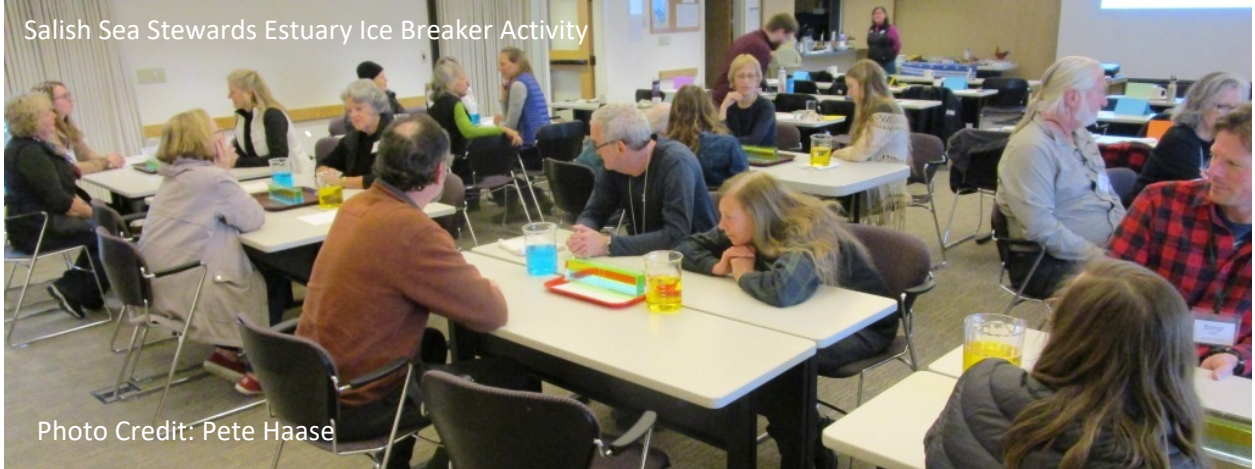
Salish Sea Stewards Estuary Ice Breaker Activity