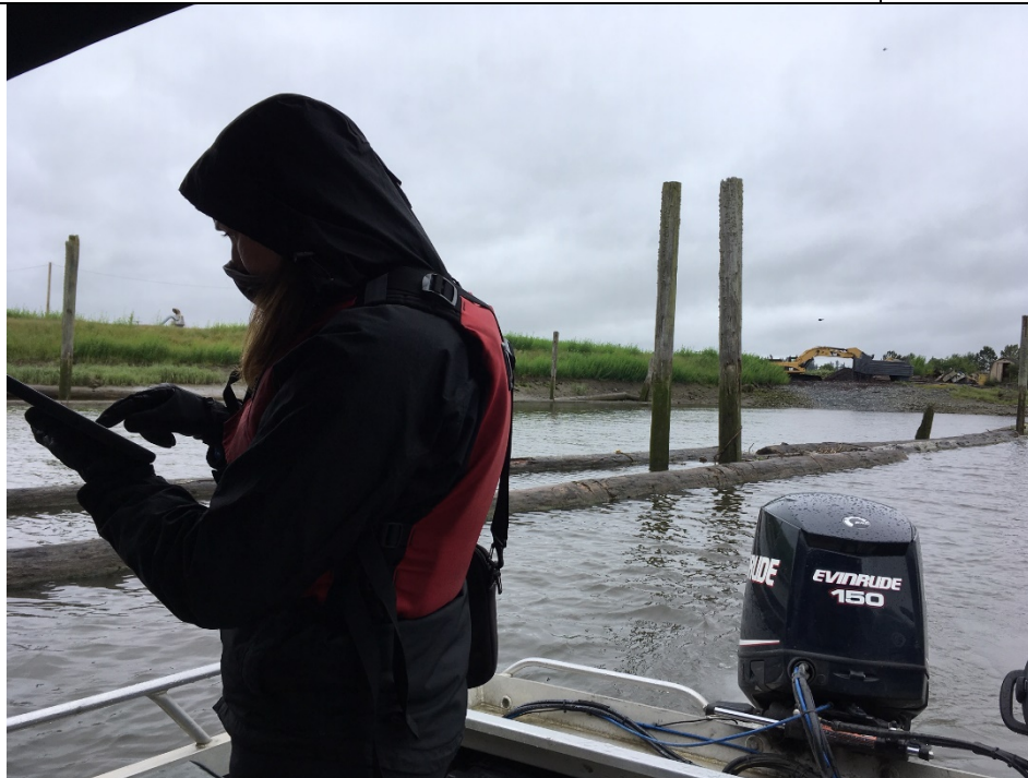
Conducted Pilings field work on June 15th. Taking data on ipads using ARCGIS collector.