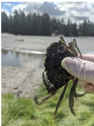
Live female European Green Crab (EGC) found in Drayton Harbor. The 100 th EGC found in inland Washington waters in 2020.

Photos (photos of recent projects or members—include project, photo credit and additional info):