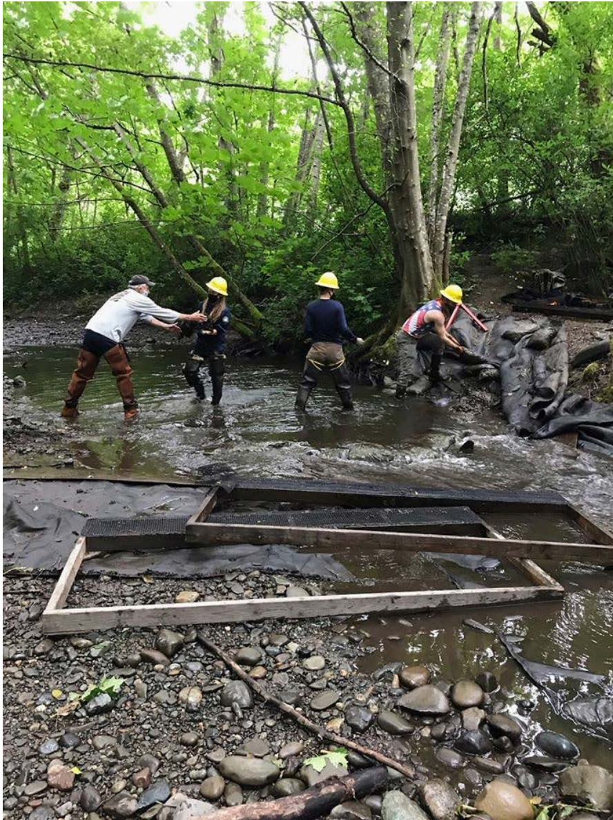
The trap on Tumwater Creek is now gone! A team from Lower Elwha Tribe, Washington Conservation Corps and Clallam MRC met in the morning and in about one hour the trap was dismantled.