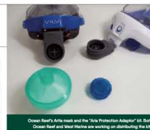
Ocean Reef's Adip mask and the "Air Protection Adaptor" kit built by Ocean Reef and West Marine are working on distributing the kit.

West Marine plans on distributing approximately 1,200 masks to hospitals able to utilize respirators. After several weeks of testing and coordination with Ocean Reef, the manufacturer of