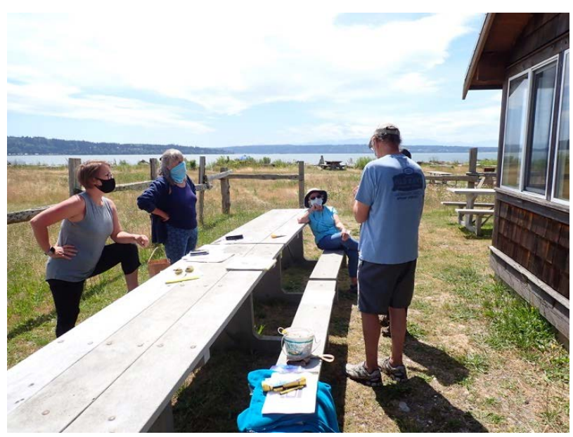
Bull kelp volunteer training. (Photo credit: Vernon Brisley).

Photos (photos of recent projects or members—include project, photo credit and additional info):