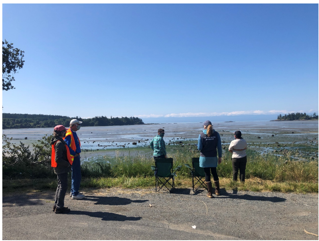
MRC and False Bay volunteers conducting visitor-use surveys during the July 4<sup>th</sup> weekend.

Photos (photos of recent projects or members—include project, photo credit and additional info):