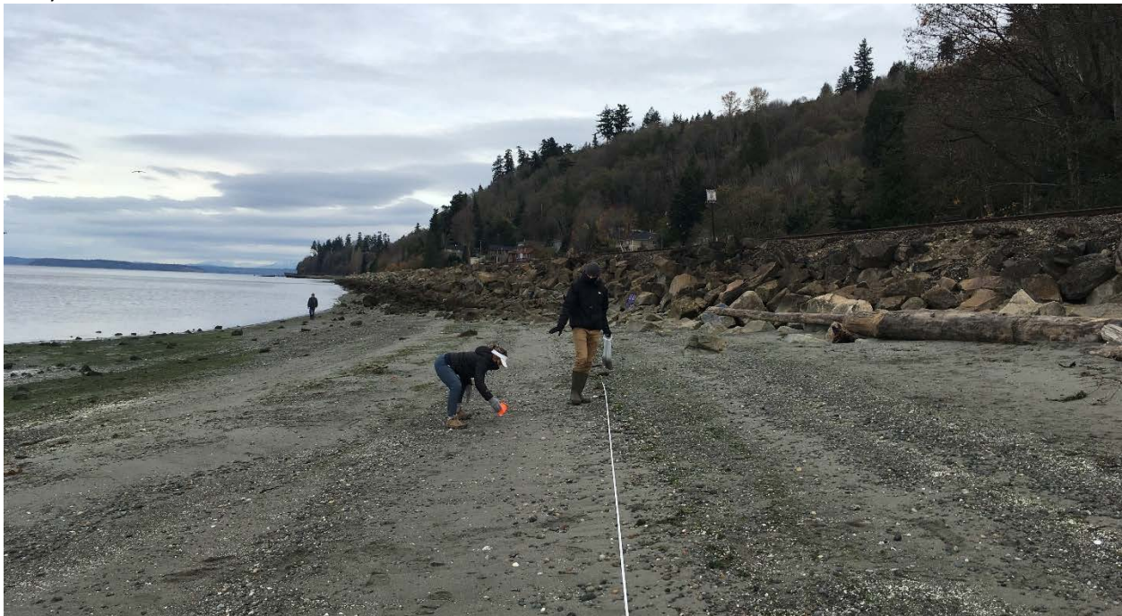
The SnoCo MRC takes a forage fish sample at Picnic Point.

Photos (photos of recent projects or members—include project, photo credit and additional info):