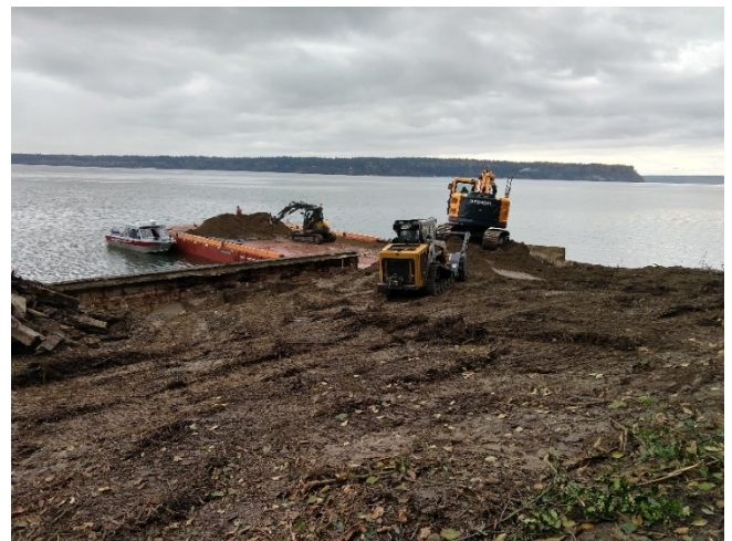
Seahorse Siesta Restoration: Left: Material from old barge. Right: Material being removed.