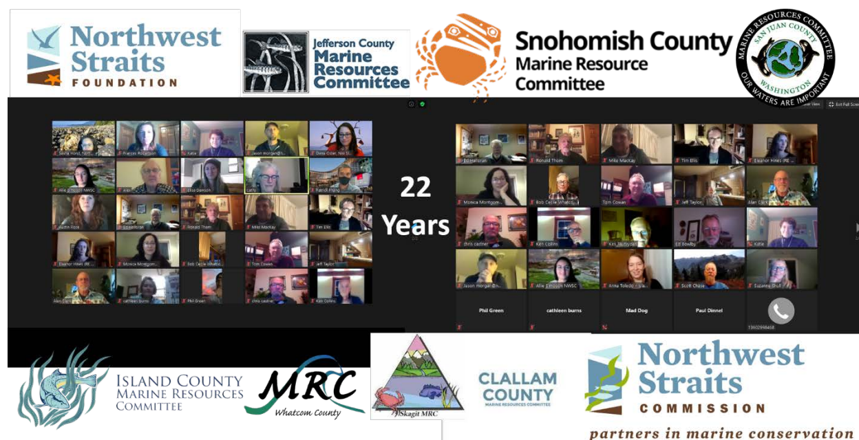
A composite screenshot of all who attended the NWSI 22 nd Anniversary celebration on November 20.

Photos (photos of recent projects or members—include project, photo credit and additional info):