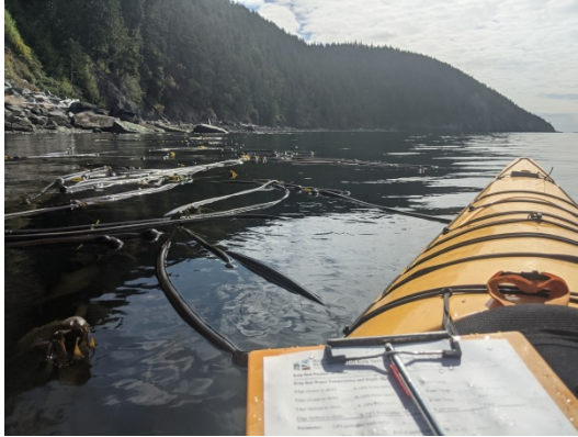
Eleanor Hines' kayak bull kep survey at SW Lummi Island.

Photos (photos of recent projects or members—include project, photo credit and additional info):