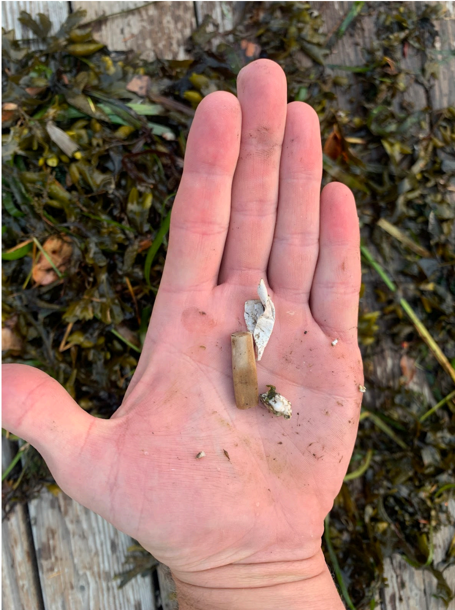
Figure 2. Aug 2 - Aug 3 2021, Deer Harbor

Weight of catchment + Weight of catchment bag = 10.42 lbs