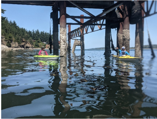
Volunteers surveying kelp bed under T-Span at Aiston Preserve.