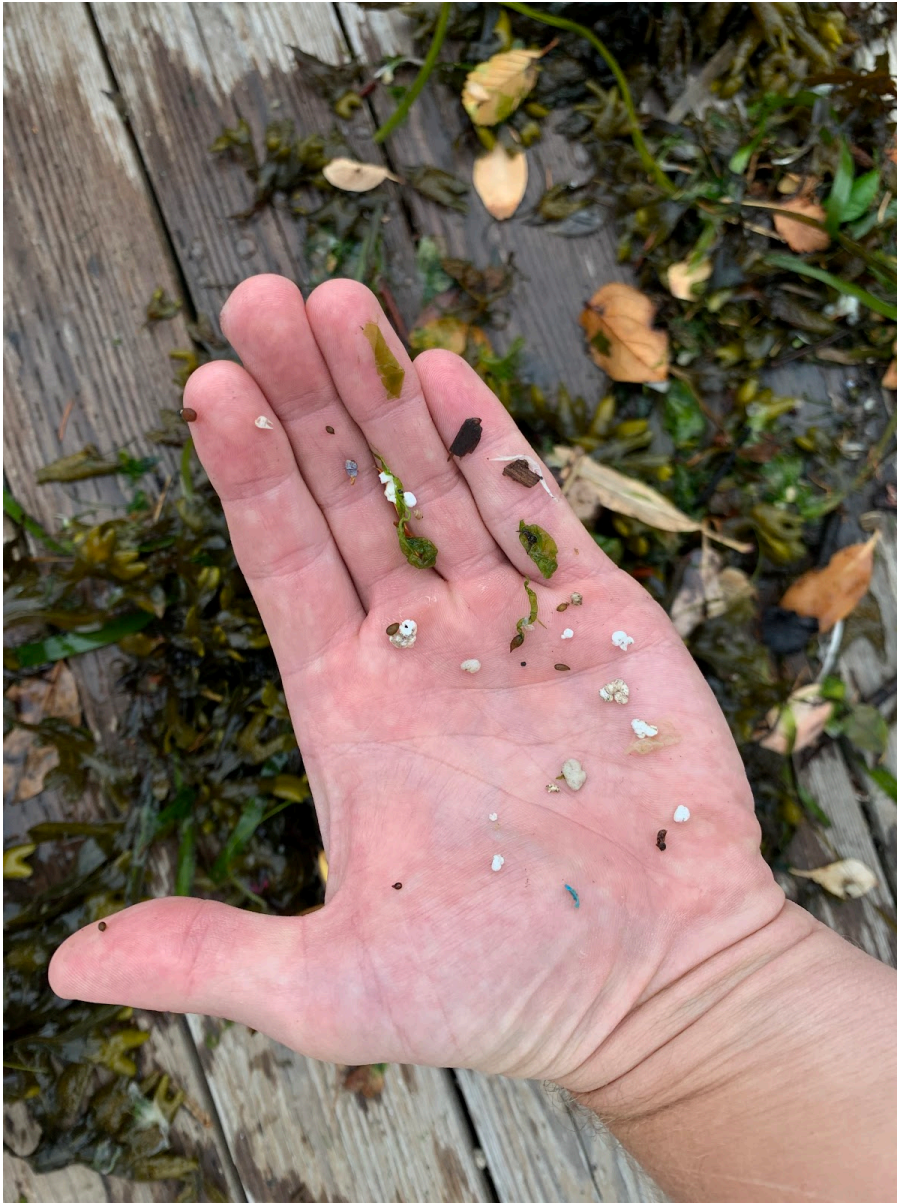
Figure 1. SeaBin catchment from Aug 1 - Aug 2 2021, Deer Harbor

Weight of catchment + Weight of catchment bag = 21.28 lbs