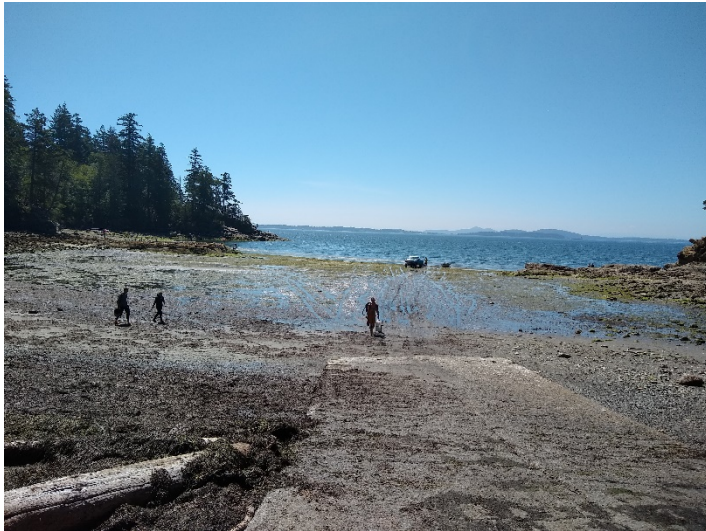
Truck driving over eelgrass bed at Larrabee State Park during low tide.