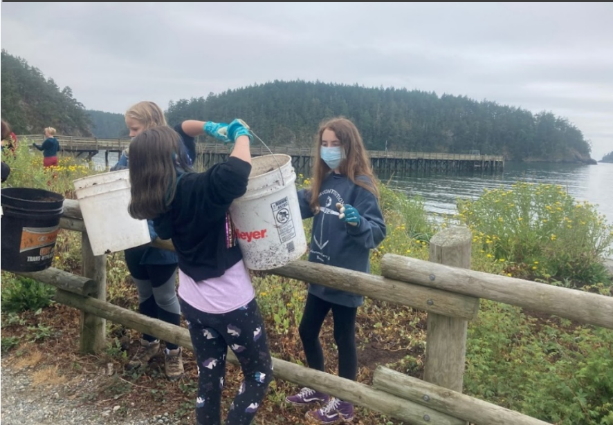
Salish Sea School student volunteers practicing good teamwork while mulching the restoration site