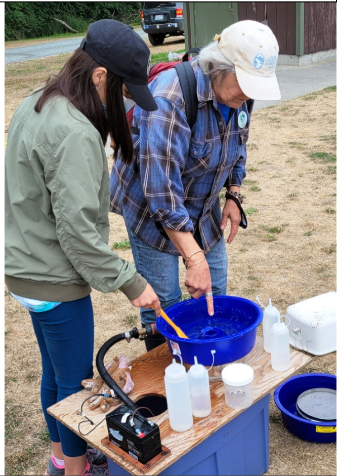
Lots of learning opportunities for the public (above left) and Salish Sea School students (above right)