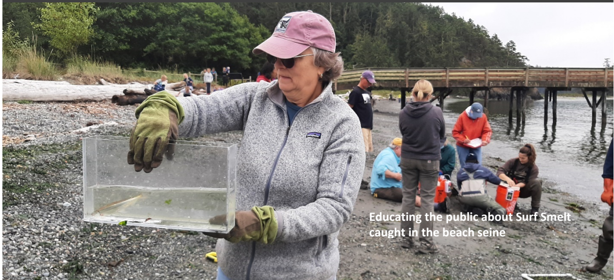
Educating the public about Surf Smelt caught in the beach seine