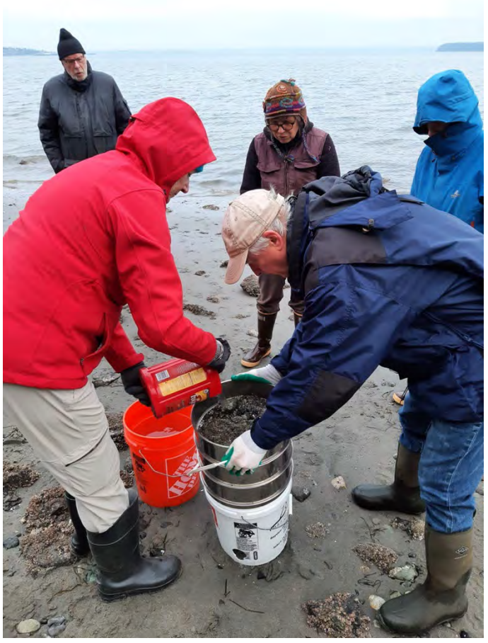
Jan 25 Dabob Bay Forage Fish Survey