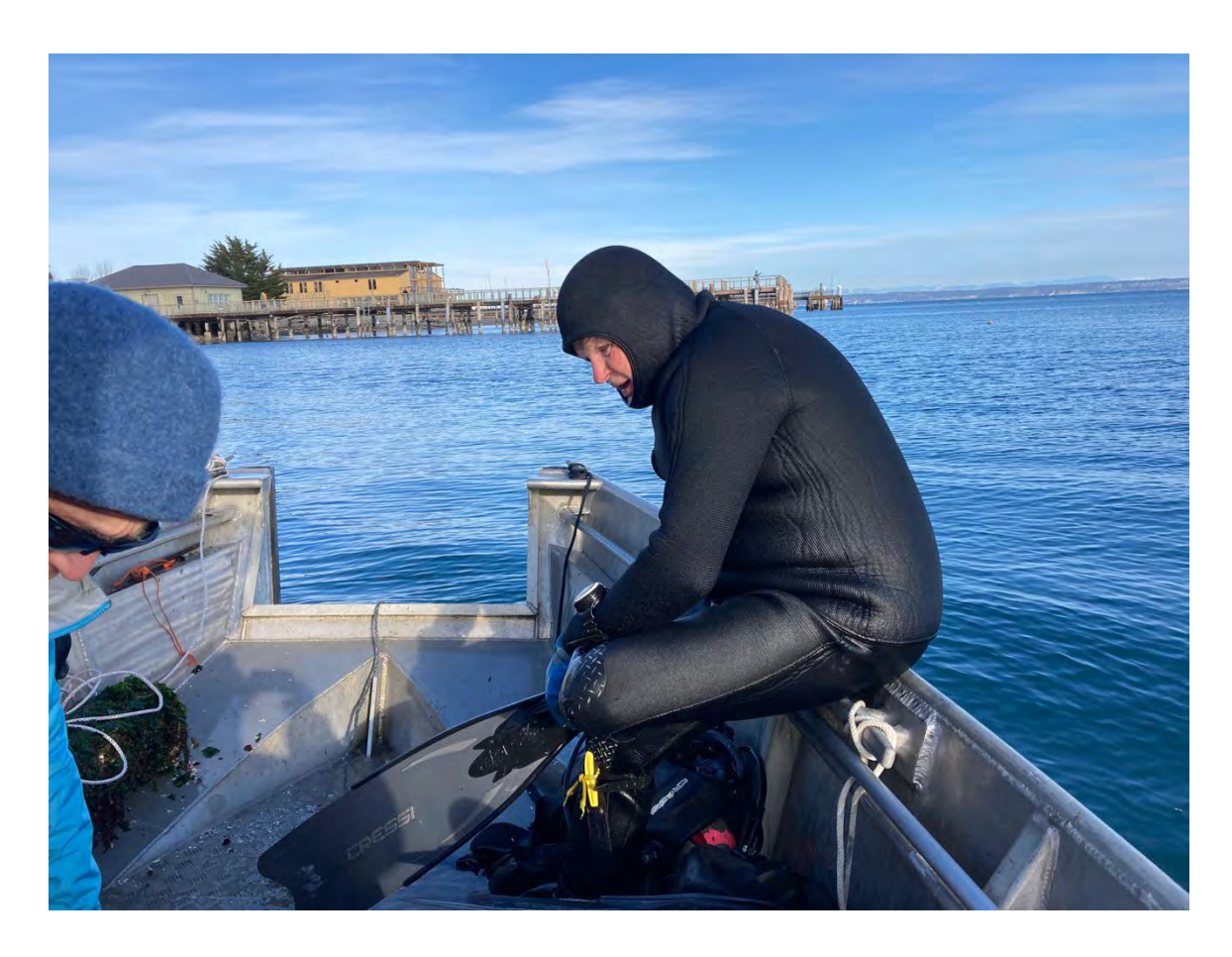
Jan 24 Fort Townsend Forage Fish Survey