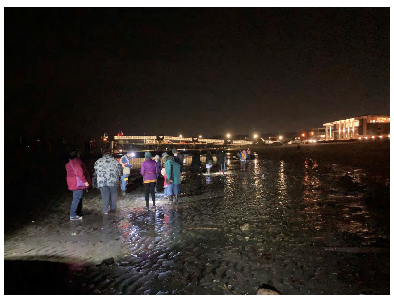
Starlight Beach Walk at Olympic Beach in Edmonds on January 28.