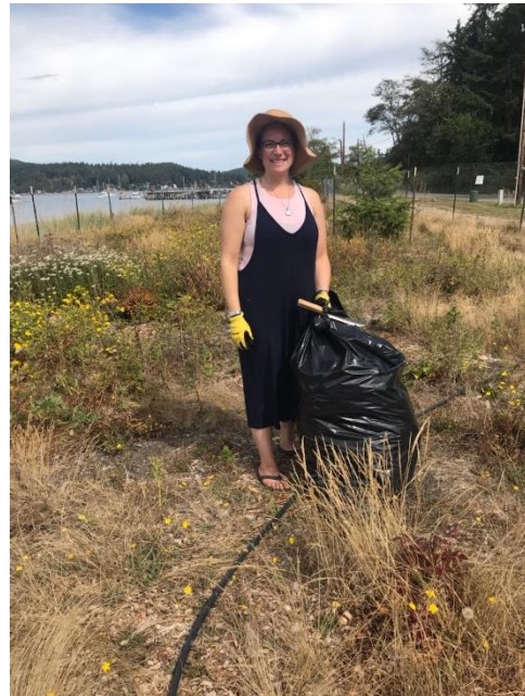
Vegetation maintenance at Cornet Bay.