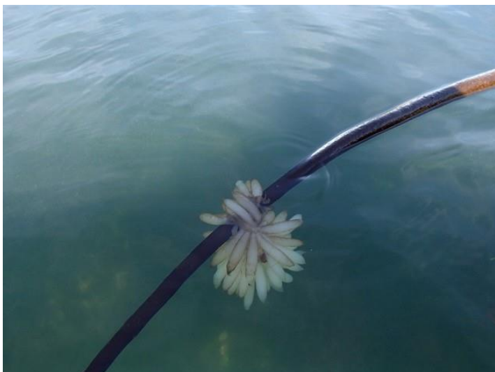
Possible squid egg sac at Possession Point.

Volunteers also collected temperature data using temperature loggers at varying depths and collected images of plants and animals observed in the kelp beds.