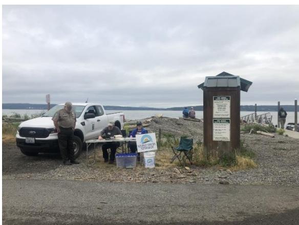
2021 crabber opening day.