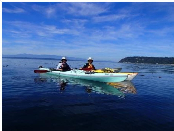
Volunteers conduct bull kelp surveys at Possession Point.