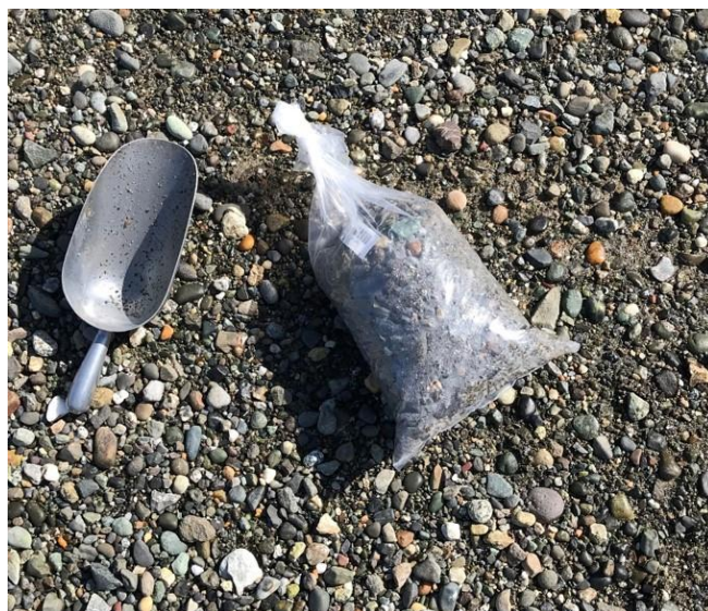
Forage fish spawn surveys.