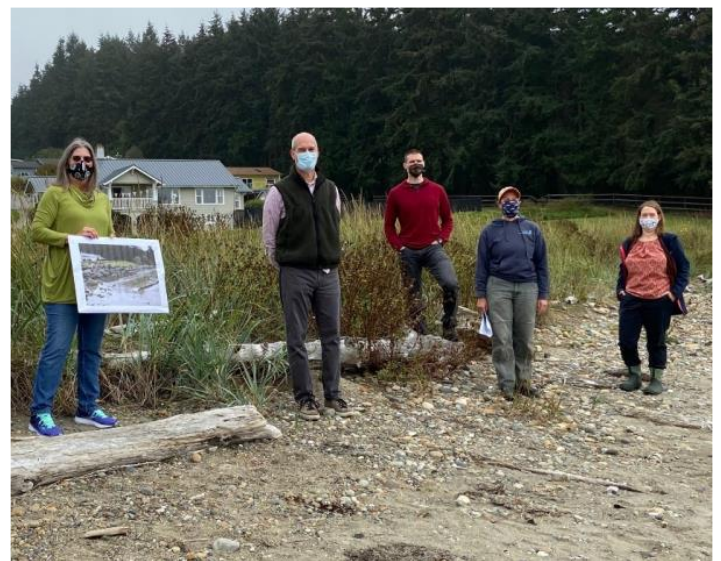
Right: Congressman Larsen visits the Sunlight Shores restoration site.