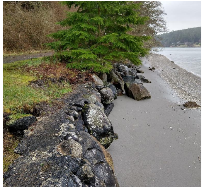
Shoreline armoring at Hoypus Point.

The MRC has worked with the NWSF (project sponsor) and WSP to move the project forward into final design and permitting. The NWSF will lead the project through construction as the MRC continues to partner in the restoration and monitoring process.