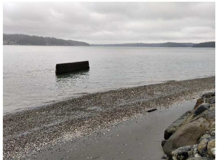
Shoreline armoring at Hoypus Point.