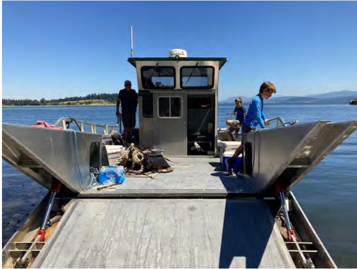
Specialized Marine Transport landing craft