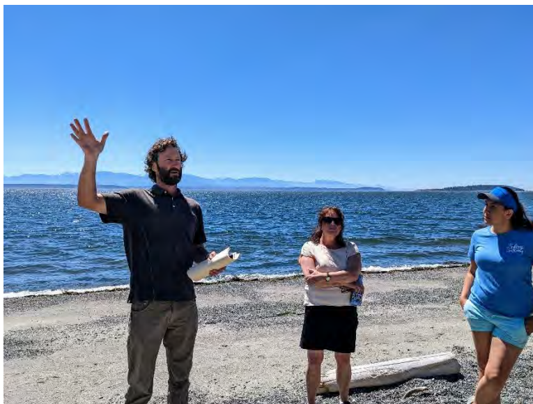
Meeting w/ WCLT Director