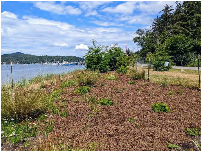
After Weeding and Mulching at Cornet Bay Restoration

Photos (photos of recent projects or members—include project, photo credit and additional info):