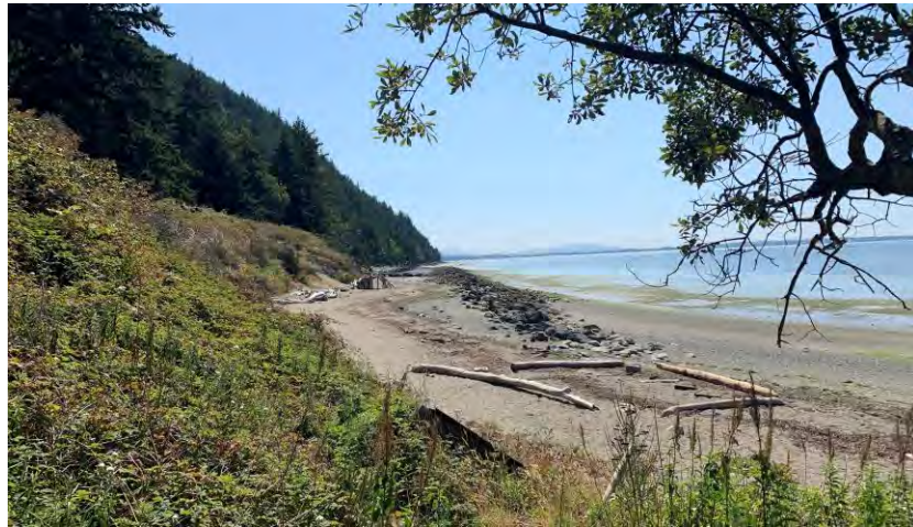
Clayton Beach at low tide

Clayton Beach: USFWS Puget Sound Coastal Program informed us that we will be awarded $75,000 towards the feasibility and design of the project. The award process is underway.