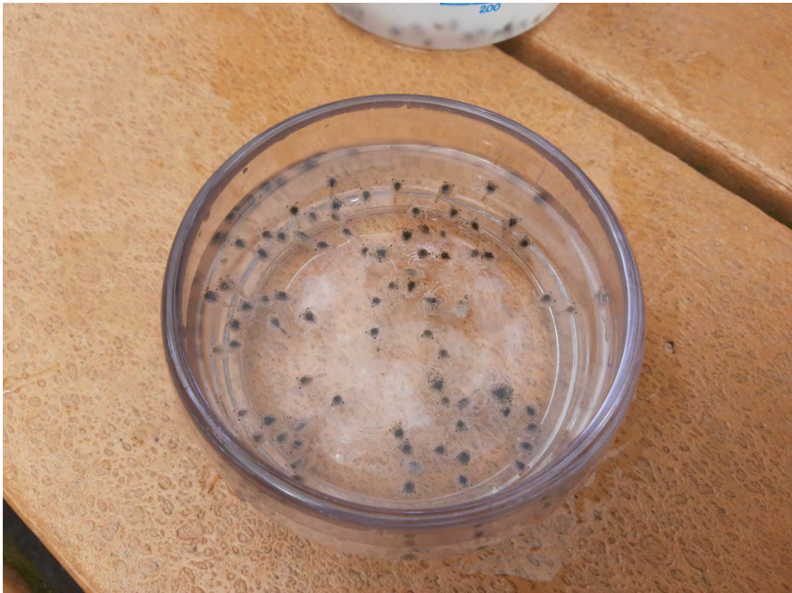
Megalopae collected from the PCRG light trap at PTMSC