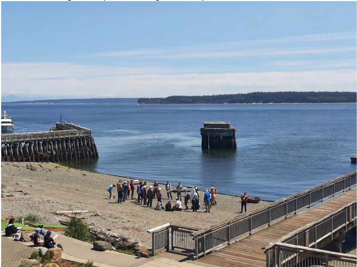
July 13 WDFW-NWSI forage fish in-person training