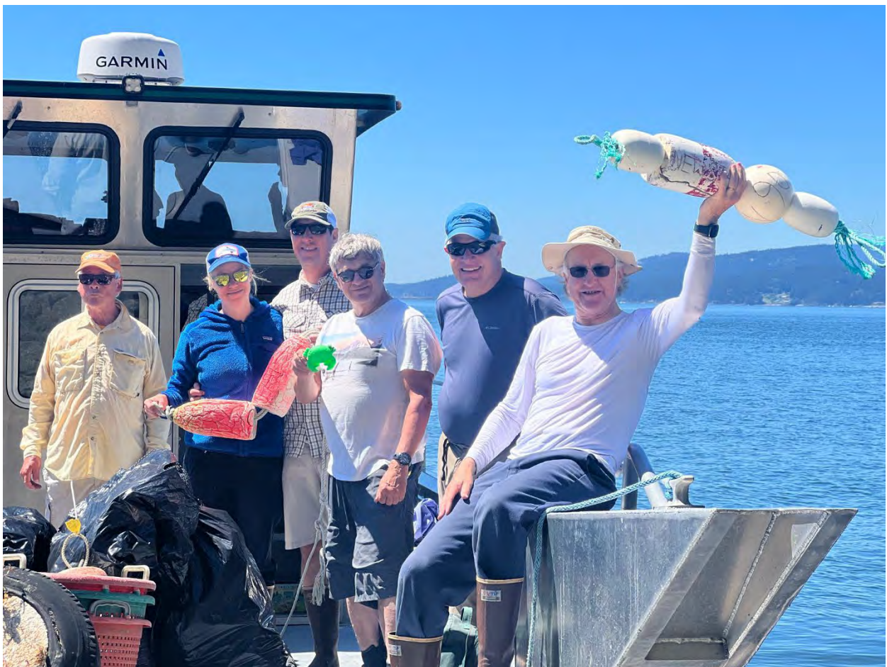
Whatcom MRC members with debris removed from SW Lummi Island