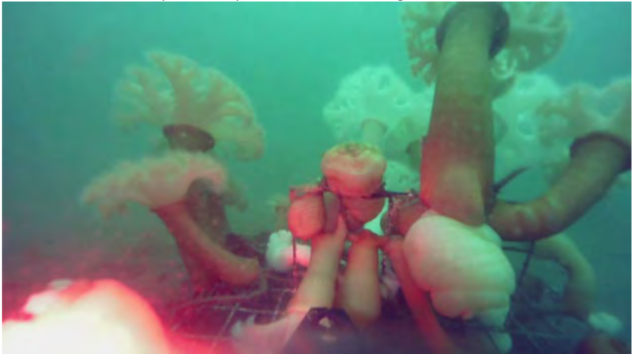
Image from the ROV of derelict pots left in place that are functioning as artificial reefs

June 19, 20 & 21 ROV surveys @ Adelma Beach in Discovery Bay