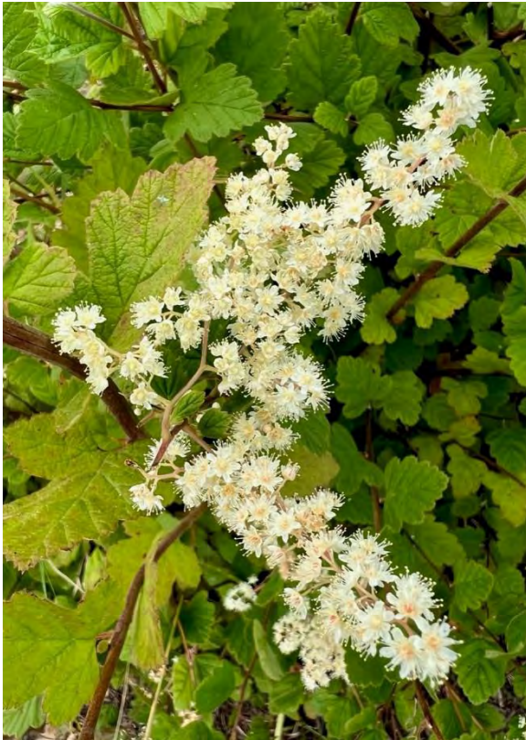
Ocean Spray blooming at the Cornet Bay Restoration