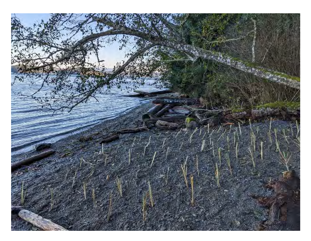
Hoypus Point - Dunegrass