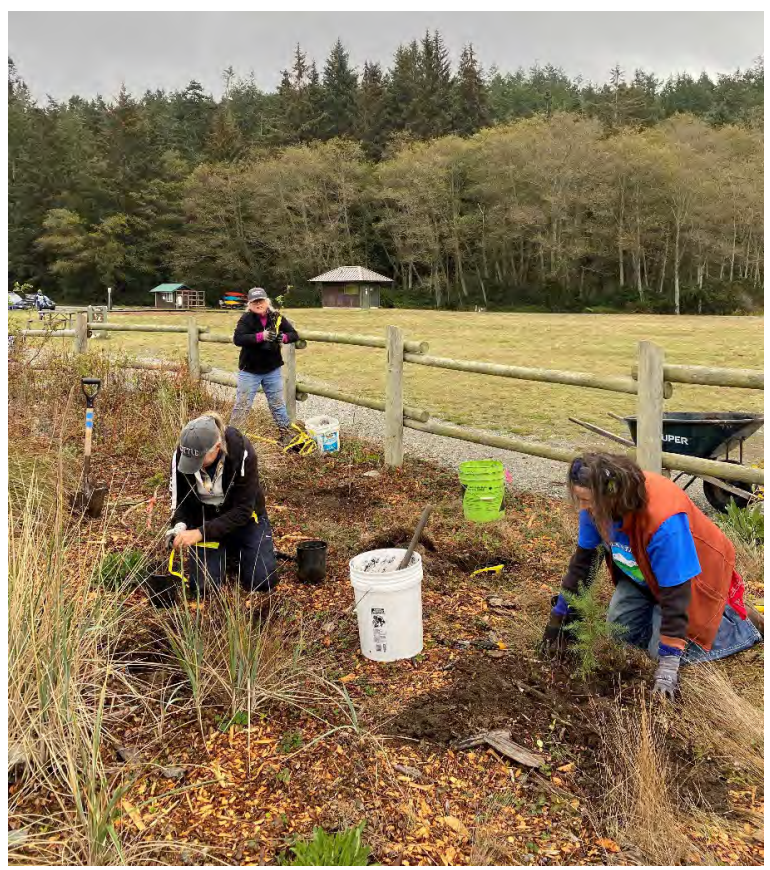
Volunteers plant native trees and shrubs at the Bowman Bay Restoration Site

On November 3rd, the Northwest Straits Foundation partnered with Skagit County Marine Resources Committee to host a planting party at Bowman Bay. A total of 17 volunteers planted over 175 native plants at the seven-year post-restored pocket beach. The added vegetation will improve the upland conditions of the site, as some of the vegetation planted in 2015 has struggled to survive. Thank you to all our volunteers!