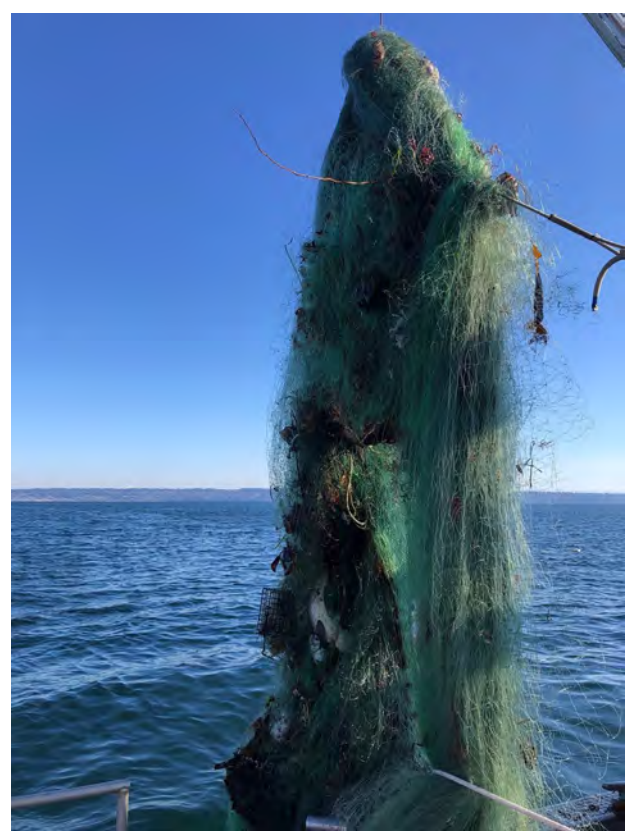
Net Removed near Port Madison, WA

This fall has continued to be a busy season for our newly lost net Reporting, Response, and Retrieval Program. Four nets were removed over the past month, in large thanks to our tribal partners' collaboration on the reporting and removal of newly lost gillnets. It is imperative that newly lost nets are reported immediately so we can locate them and initiate removal efforts before weather conditions cause them to move and potentially be lost forever. We cannot do this without our partners in fisheries throughout the Puget Sound region.