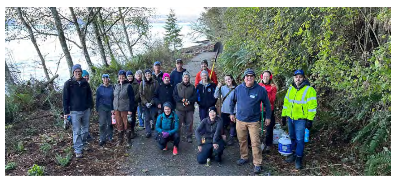
Volunteers and staff celebrate after planting over 1,300 plants at the newly restored Hoypus Point

The final phase of restoration at the Cornet Bay Day Use Area of Deception Pass State Park was completed by PNW Civil, Inc. in November. The project, designed by Blue Coast Engineering, removed 350 linear feet of armor rock, concrete, and fill from Hoypus Point on the northern end of the park to restore the habitat forming processes that support this bluff-backed beach. Hoypus Point was historically the site of a ferry that shuttled residents between Whidbey and Fidalgo islands before the Deception Pass bridge was built. 19 volunteers joined Foundation, Island MRC, and State Parks staff in planting over 1,300 trees, shrubs, grasses, and perennials to reestablish a marine riparian corridor to benefit salmon, forage fish, and birds. Funding for the project was provided by the Salmon Recovery Funding Board and Washington Department of Fish and Wildlife's Estuary & Salmon Restoration Fund. Come join us this spring as we begin the next phase of work – stewarding this amazing place to ensure the vegetation flourishes.