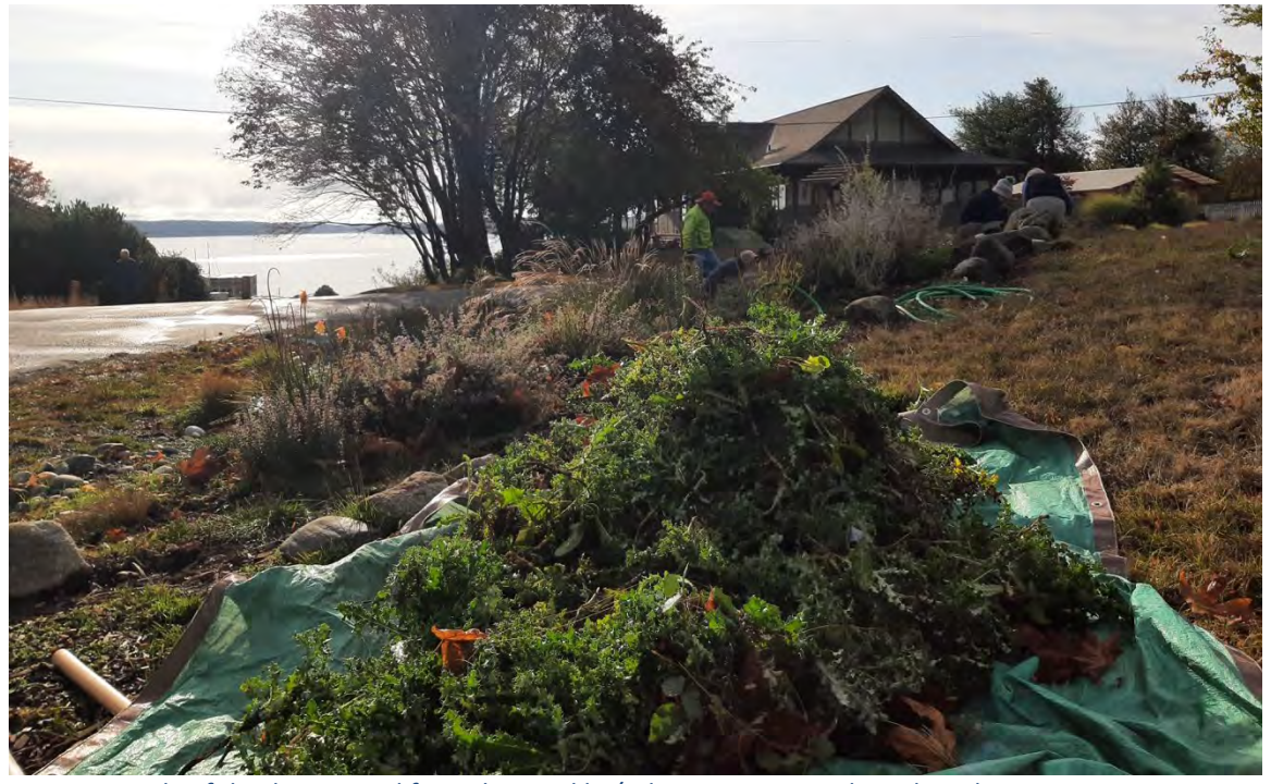
Pile of thistle removed from the Franklin/Adams St. rain garden.