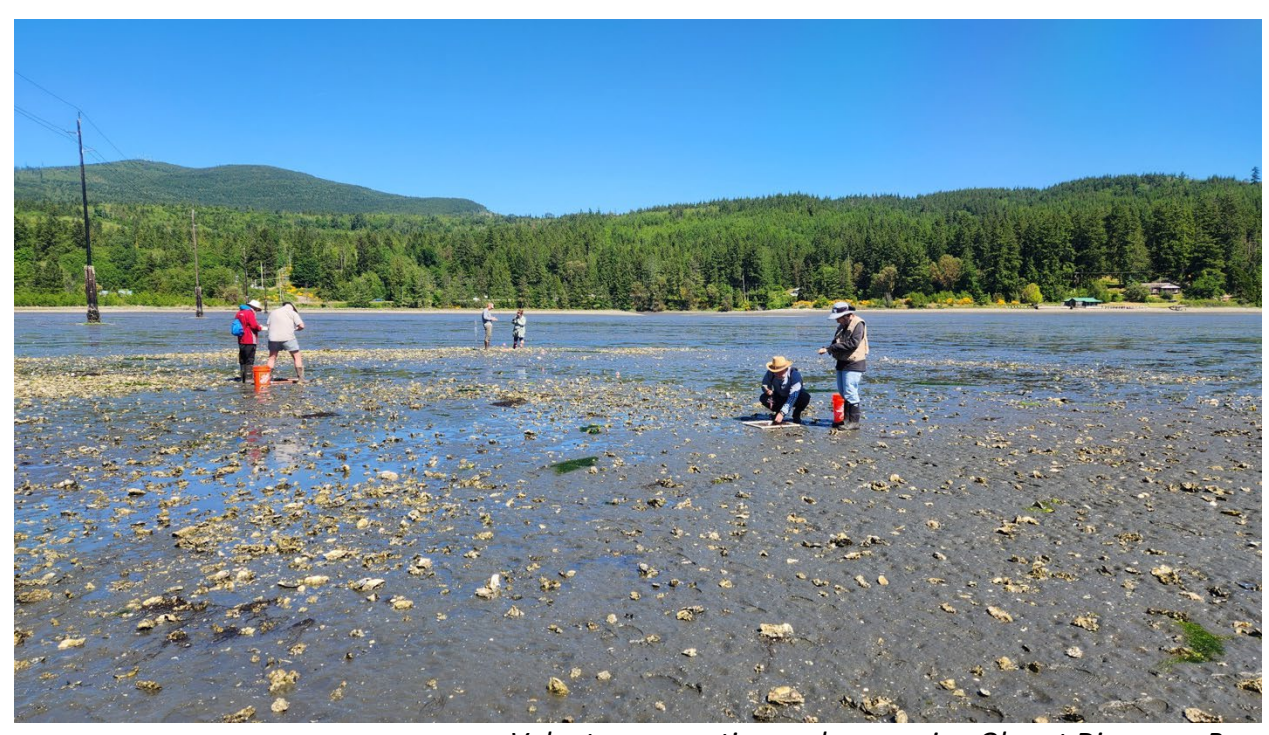
Volunteers counting and measuring Olys at Discovery Bay.