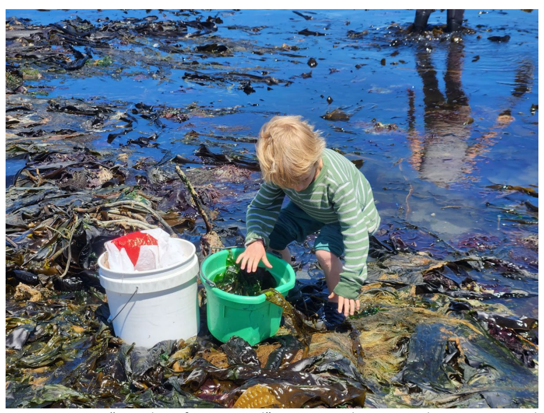
A young "Searching for Seaweed" participant learning to harvest seaweed.