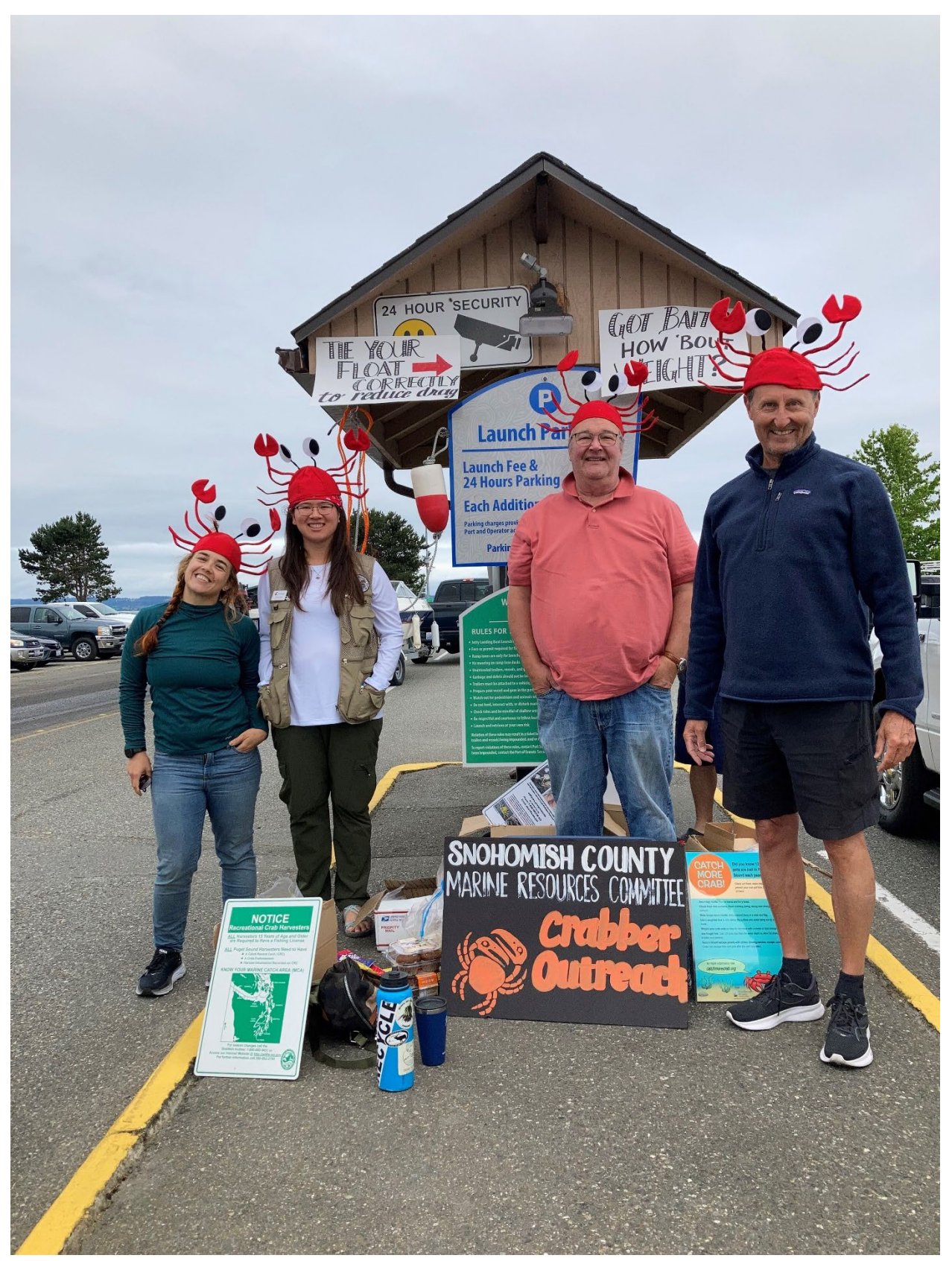
Crabber Outreach in Everett.