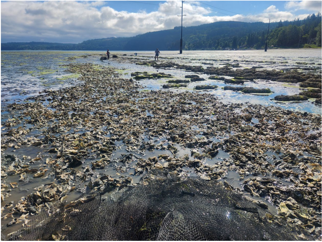
Nearly half the bags emptied and shell spread

July 18 – Kelp linear extent survey (Beckett Point around Marrowstone Island to Port Townsend Channel)