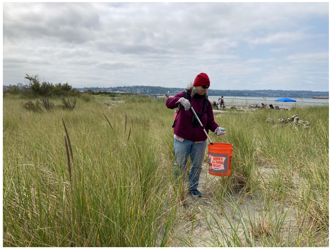
Beach Cleanup on Jetty Island.