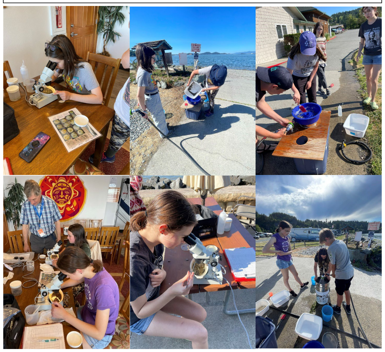
MRC-Salish Sea School Intern – Forage Fish Survey Research Project