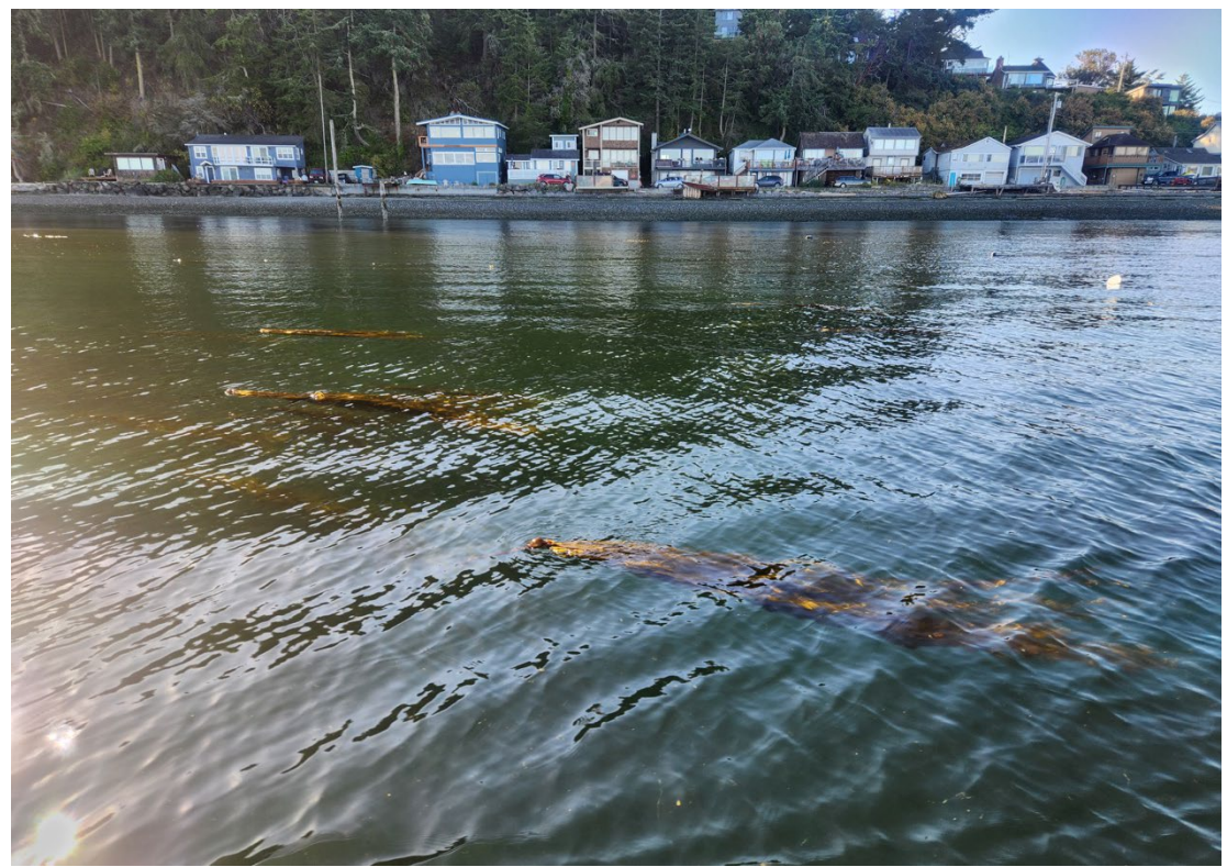
Kelp bed at Beckett Point

July 18 – Kelp linear extent survey (Beckett Point around Marrowstone Island to Port Townsend Channel)