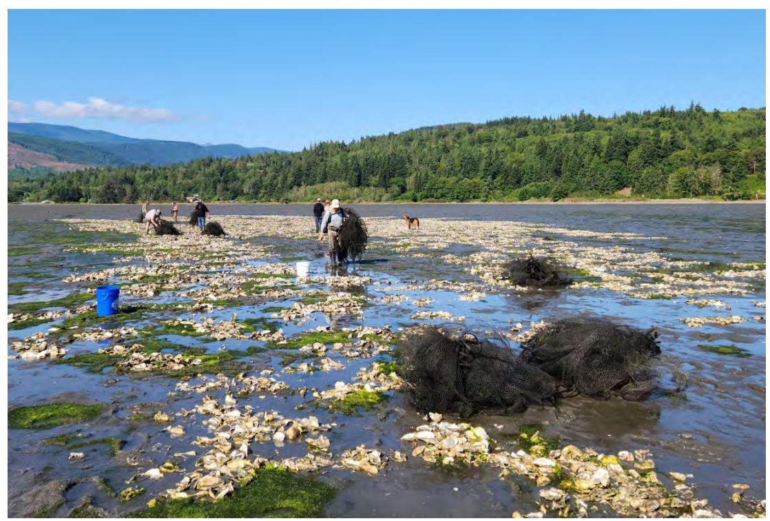
Volunteers bundling up emptied mesh shell bags to haul out.