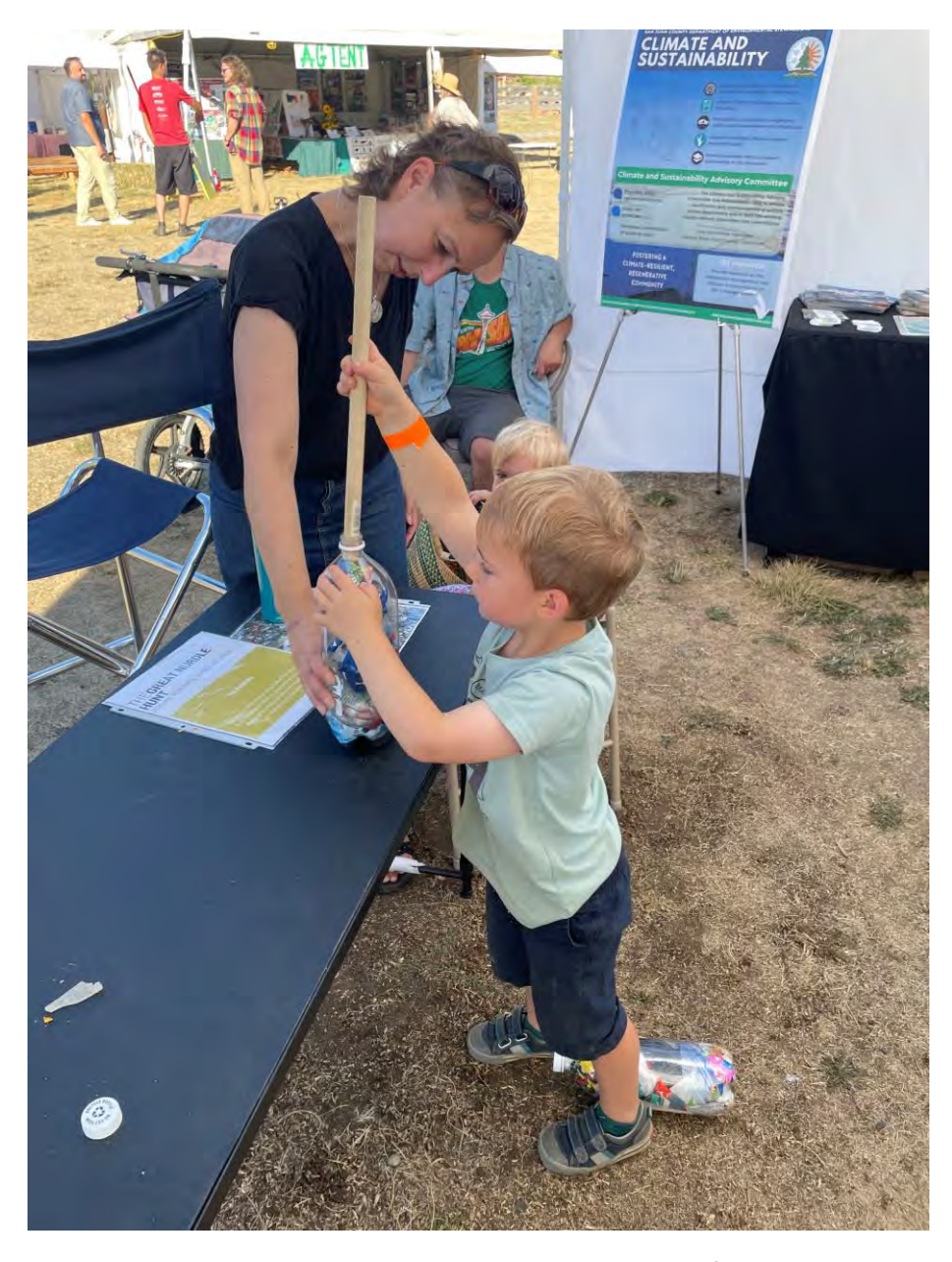
Island children helping to make an eco-brick at the county fair.