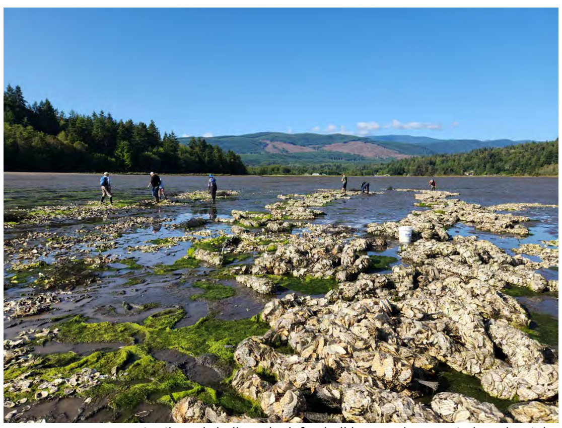
Distributed shell on the left, shell bags to be emptied on the right.