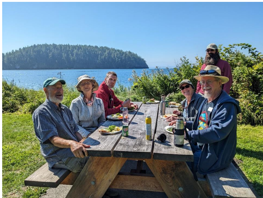
Volunteer Engagement Event – Bowman Bay

Photos (photos of recent projects or members—include project, photo credit and additional info):