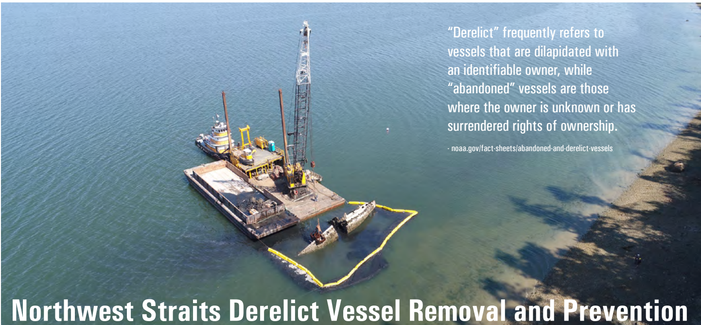
Windjammer removal.

“Derelict” frequently refers to vessels that are dilapidated with an identifiable owner, while “abandoned” vessels are those where the owner is unknown or has surrendered rights of ownership.