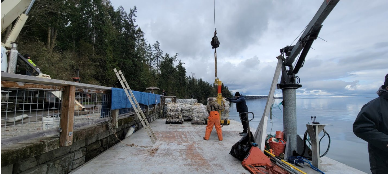
Olympia Oysters: Barge crew loads the first few of a total of 100 pallets of Pacific oyster shell onto the barge by crane.

Photos (photos of recent projects or members—include project, photo credit and additional info):