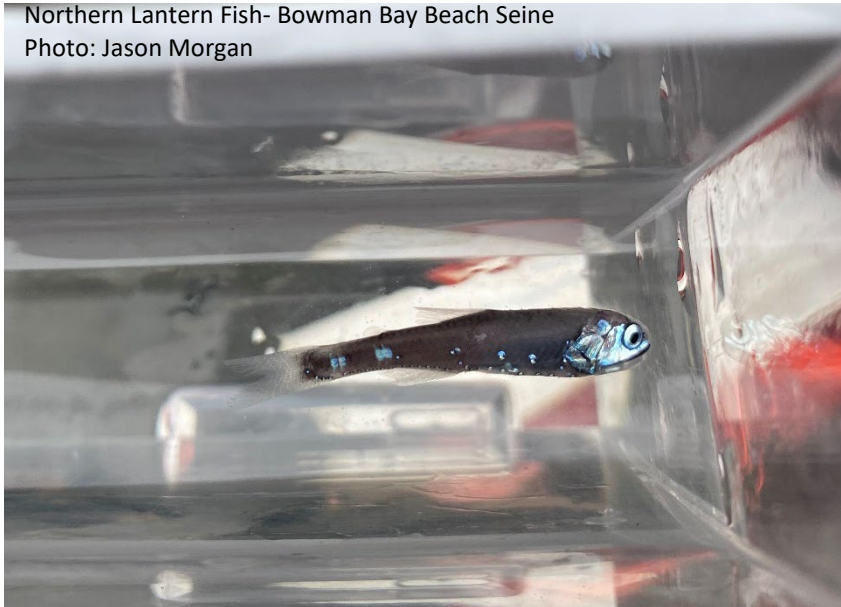
Northern Lantern Fish- Bowman Bay Beach Seine

Photos (photos of recent projects or members—include project, photo credit and additional info):