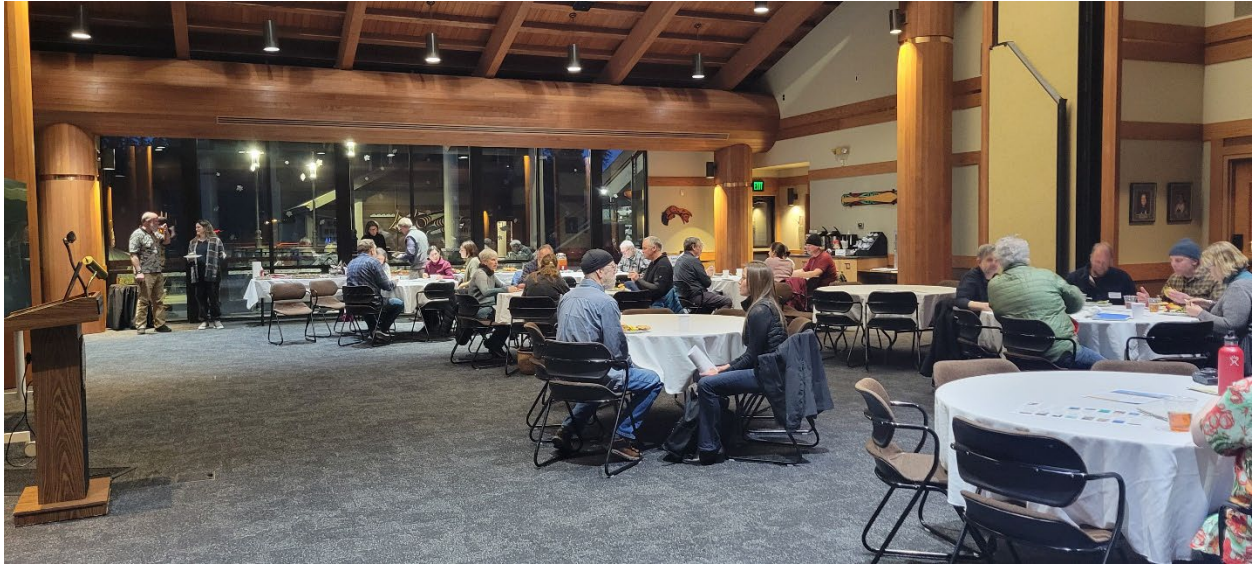
Joint Jefferson and Clallam MRC meeting in Red Cedar Hall at Jamestown S’Klallam Tribe.