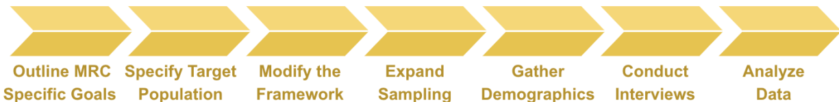
Figure 2. Recommended Interview Framework Steps

The below sequence of steps scopes the overall process of using an interview framework as a needs assessment tool to gather community input. MRCs can expect to follow this series of steps.