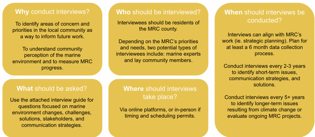
Figure 1. Answers to FAQs about the interview framework

The below information provides answers to questions about why MRCs should utilize an interview framework and what the process should entail.