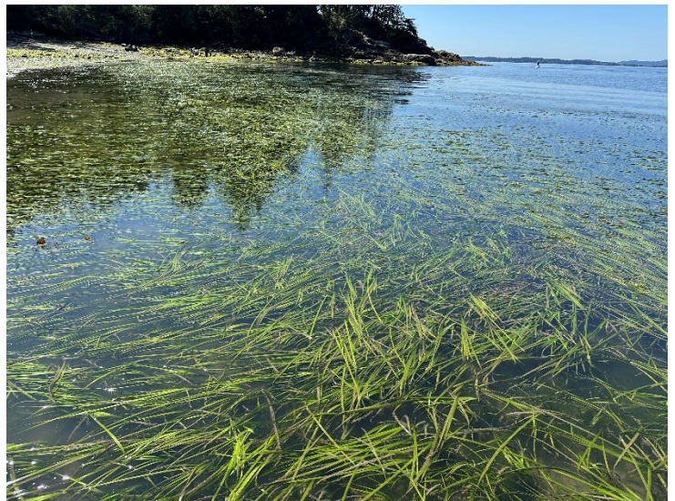
Photo credit: Dylan Trainer, NWSF Intern. Left: NWSF Intern, Alex Hasse collecting data in Wildcat Cove along the single lane that has been set up to minimize damage to eelgrass beds. Right: Eelgrass meadow in Wildcat Cove.