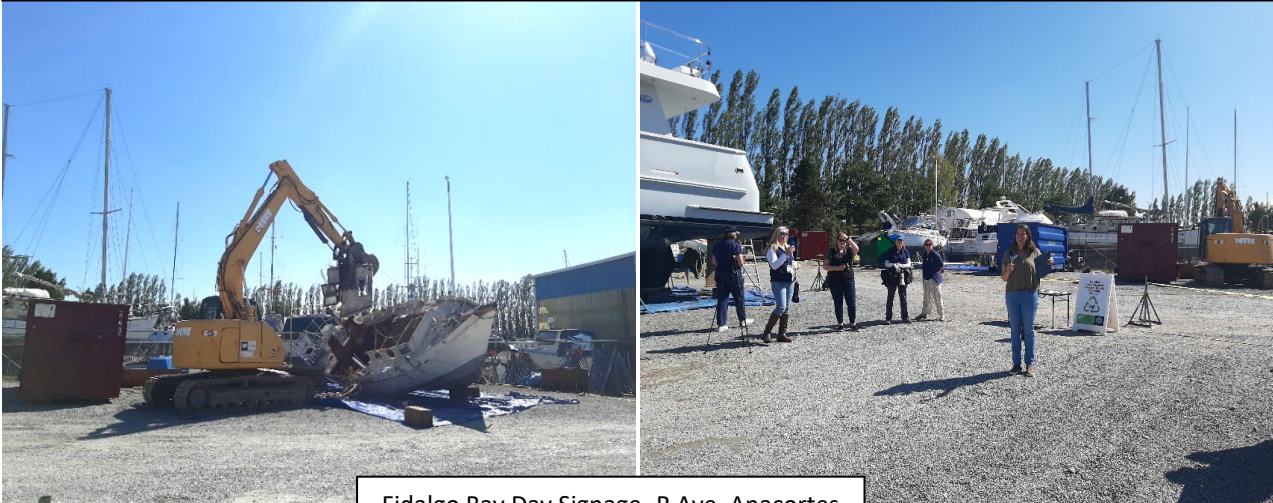
Fidalgo Bay Day Signage- R Ave, Anacortes