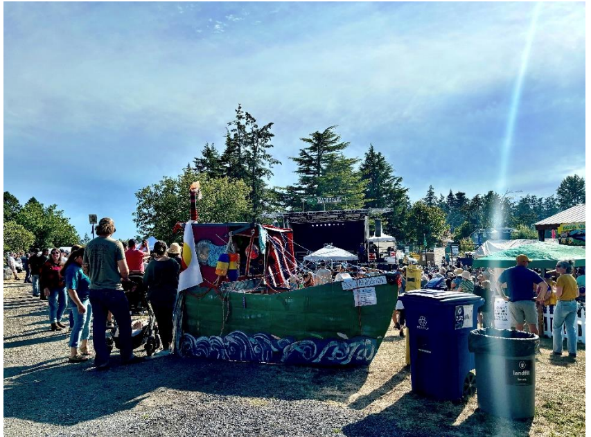
The Oh NO is high and dry in the horse arena! Quick, call the DV hotline to rescue it!/ The OH NO crashed the party at the Trasion Fashion Show – quick call the DV hotline for a rescue!