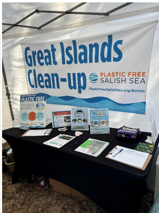
MRC Table at the San Juan County Fair. / PFSS Table at County Fair.