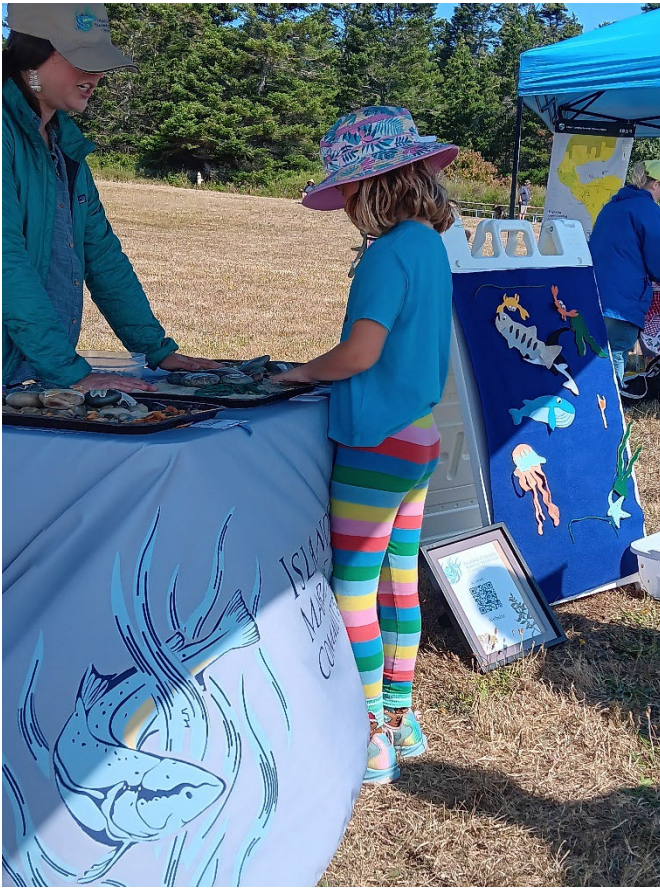
Fort Casey – Outdoor Discovery Day