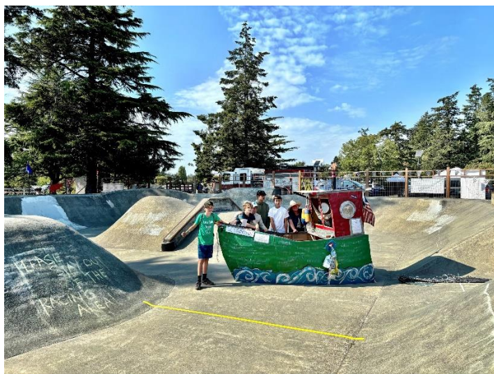
The OH NO at anchor – catch her before she drifts off! The OH NO blocking the Zucchini 500 race!