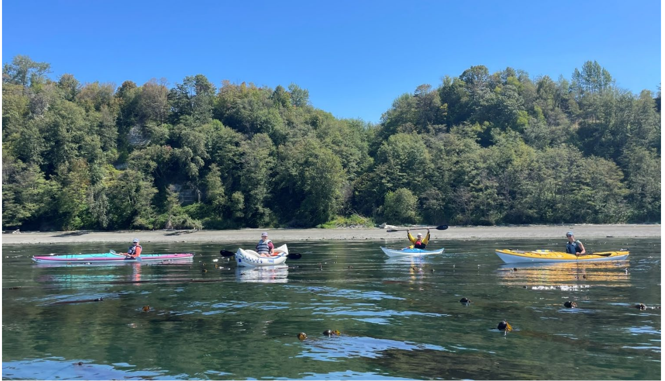
Volunteers surveying the kelp bed at Cherry Point/ Gulf Rd.