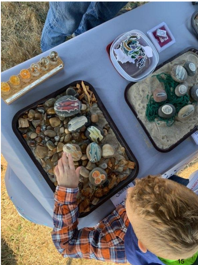
Fort Casey – Outdoor Discovery Day

Photos (photos of recent projects or members—include project, photo credit and additional info):