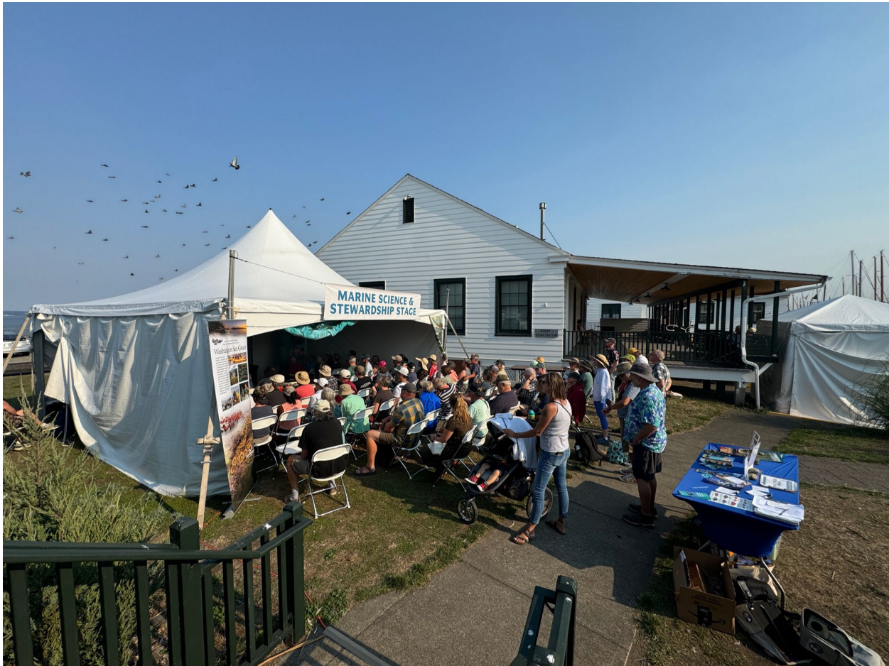
Photo: Speaker series presentation stage – we ran out of chairs! – Wooden Boat Festival, Port Townsend, WA