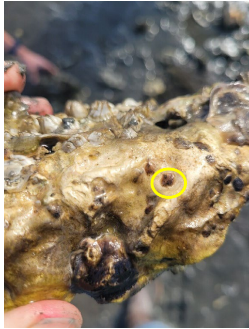
Photo: Olympia oyster 2024 recruitment seen 8/21/24 (Oly settler in yellow circle) – Discovery Bay, WA