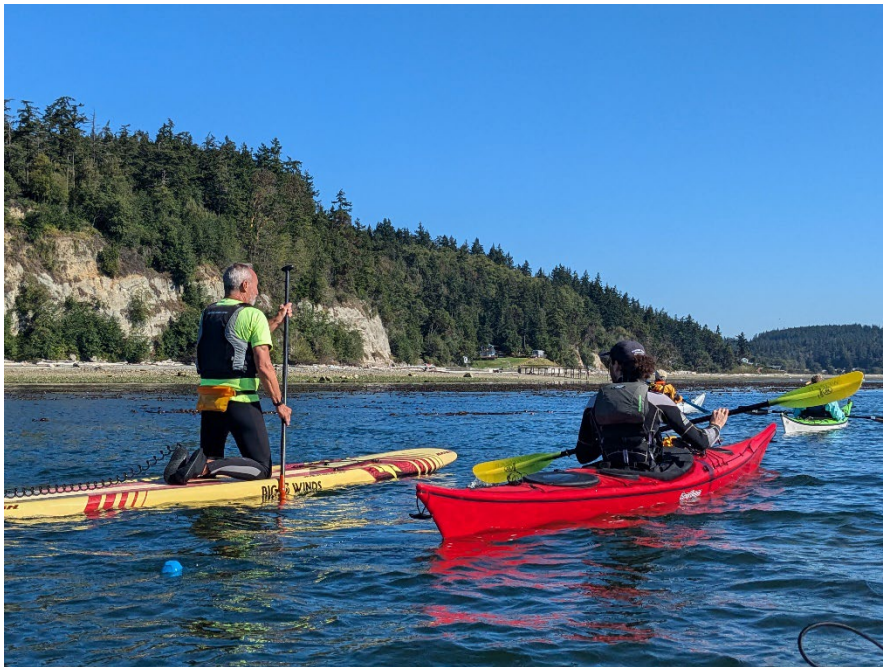
Lowell Point – Bull kelp survey

Photos (photos of recent projects or members—include project, photo credit and additional info):