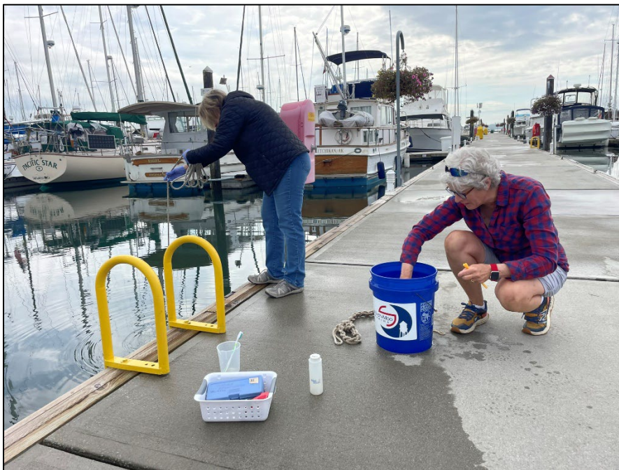
HABs volunteers collect a vertical plankton tow and environmental data at Semiahmoo Marina.