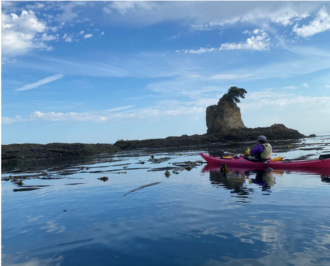
Kelp monitoring volunteer Joanne LaBaw taking measurements at Freshwater Bay. Project: kelp monitoring.