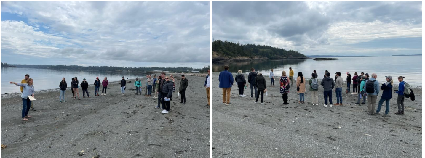
Congressional Staffer Tour, looking at the Jackson Beach creosote removal site.

Photos (photos of recent projects or members—include project, photo credit and additional info):