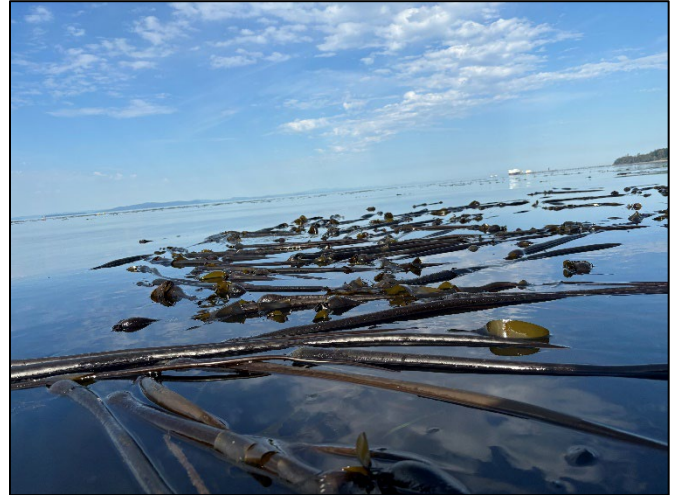
Left: Volunteers prepare to start the September kelp survey at Cherry Point. Right: Kelp bed at Cherry Point.