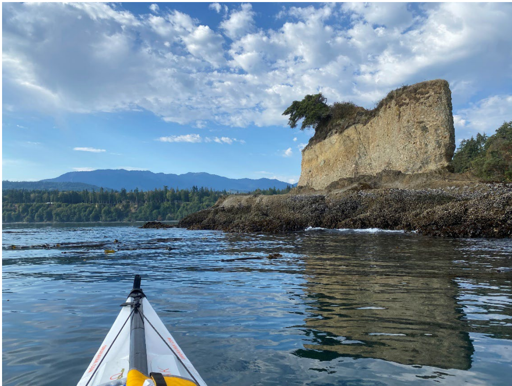
The fringing kelp in front of Bachelor Rock at Freshwater Bay, as seen from surveying kayak. Project: kelp monitoring.