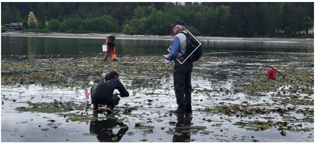
Photo 1: Conducting Olympia Oyster surveys in Sequim Bay. May 15th, 2025.