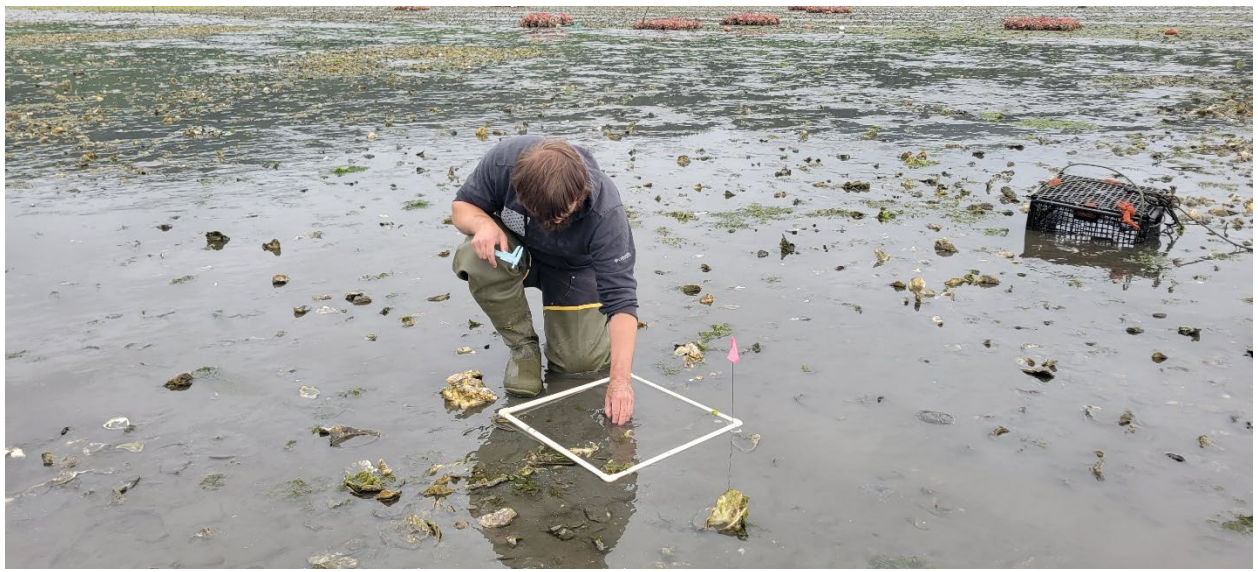
Photo 2: Conducting Olympia Oyster surveys in Sequim Bay. May 15th, 2025.