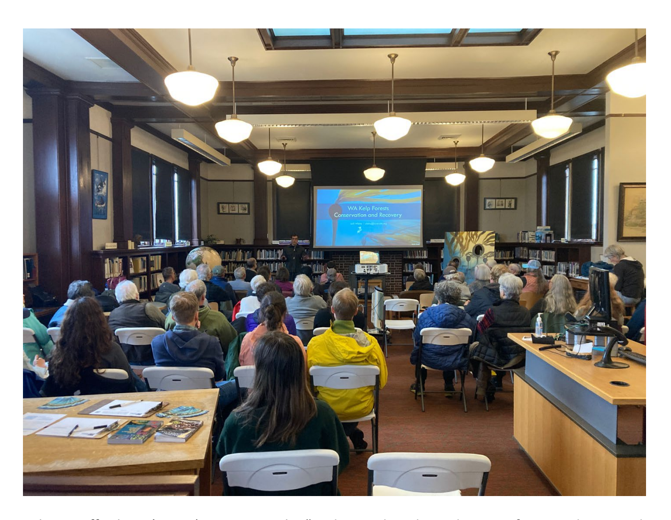
Photo: Jeff Whitty (NWSC) presents at the "Understanding the underwater forest: Kelp research and monitoring at North Beach" lecture at the Port Townsend Public Library. – 5/15/25, Port Townsend, WA