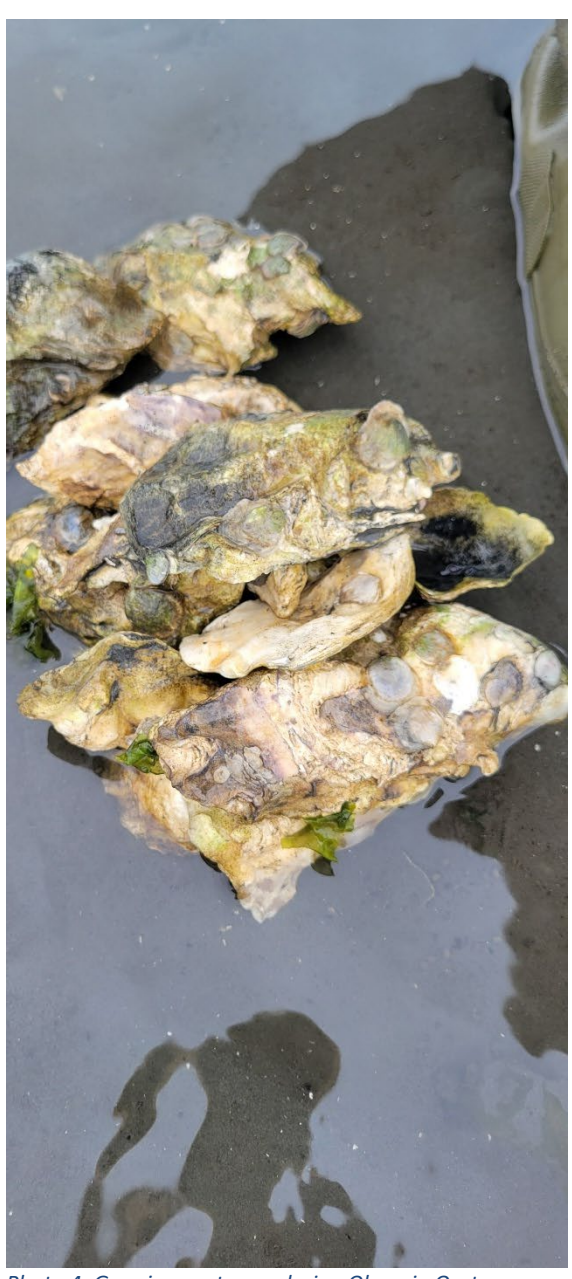
Photo 4: Growing spat seen during Olympia Oyster surveys in Sequim Bay. May 15th, 2025.