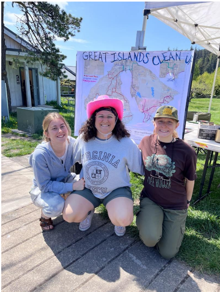
Shaw Island Nuns GICU