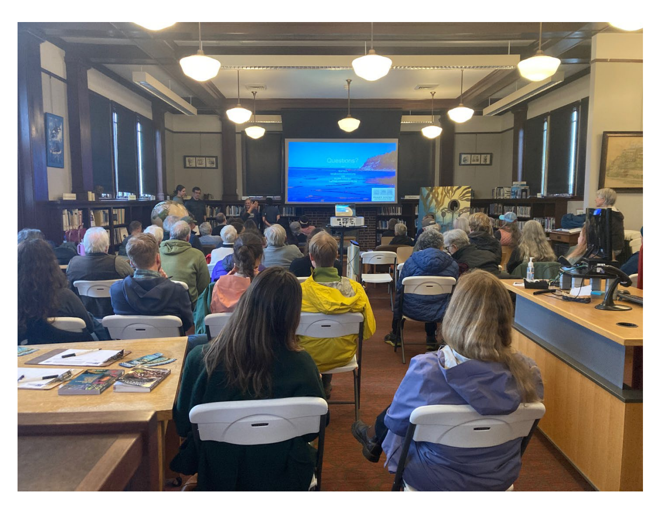
Photo: An evening lecture, "Understanding the underwater forest: Kelp research and monitoring at North Beach" was held at the Port Townsend Public Library. 50 attendees heard from Jeff Whitty (NWSC), Kari Inch (PSRF) and Sophie Schwager (PSRF) about kelp life history and presence in WA state, and the new monitoring buoy stationed off North Beach in Port Townsend. — 5/15/25, Port Townsend, WA