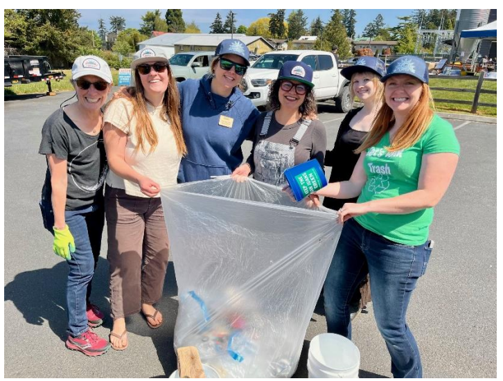
Great Islands Cleanup Photos - San Juan.