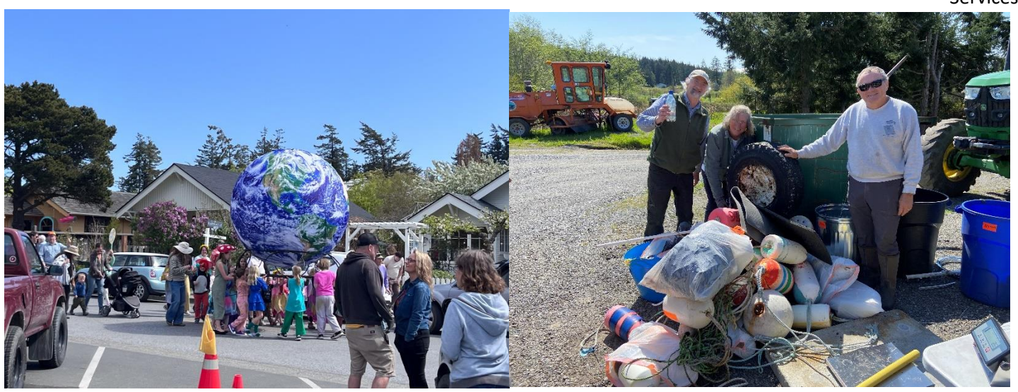
Orcas Island GICU.