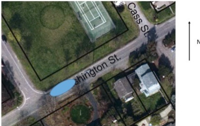
Jefferson County Courthouse Rain Garden Location