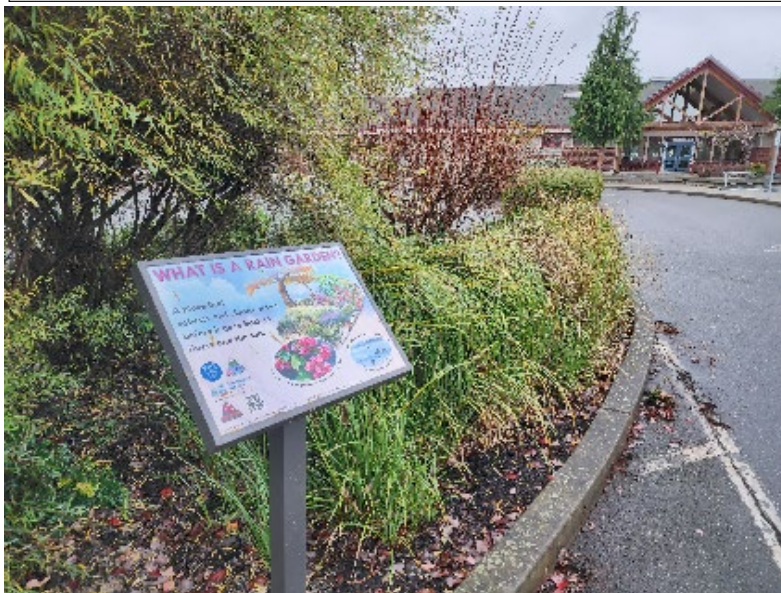
La Conner Elementary School Rain Garden, Interpretive Sign (Left) & Planting Event- Dec 10 (Right)

Photos (photos of recent projects or members—include project, photo credit and additional info)