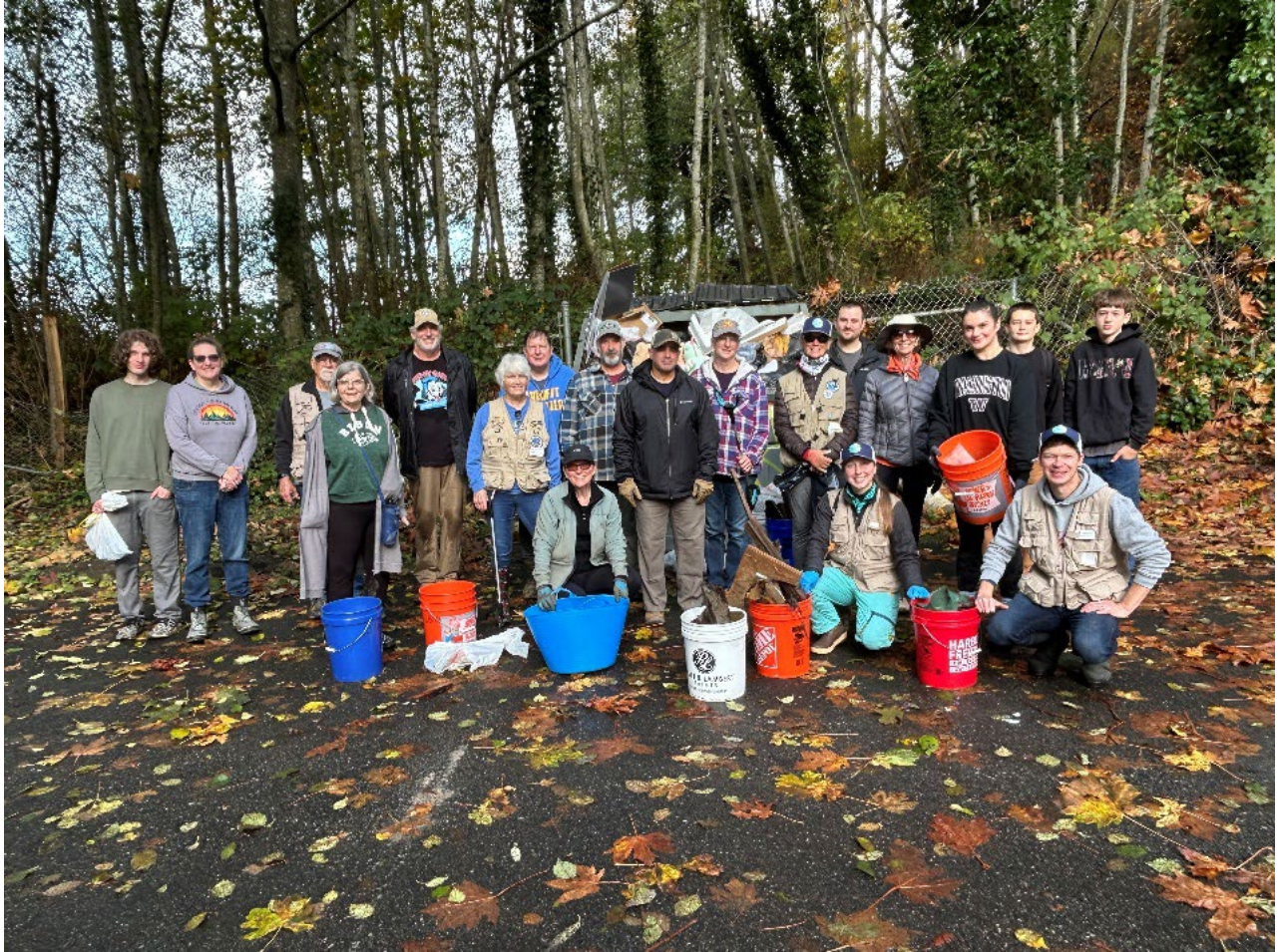
The turnout for the Nov. 2 Beach Watchers beach cleanup.