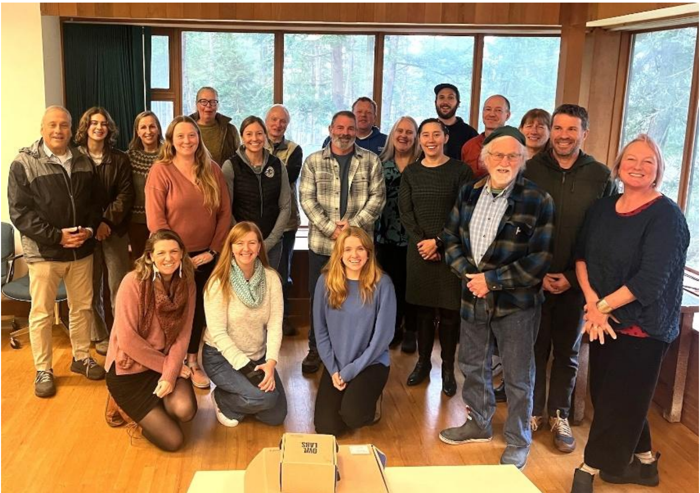
MRC Members and staff at the annual retreat.

Photos (photos of recent projects or members—include project, photos and additional info):