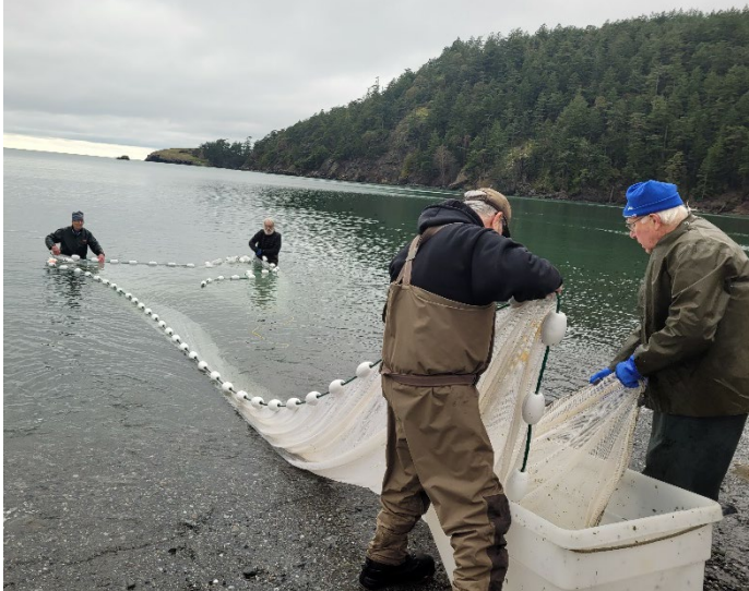
Bowman Bay Beach Seining Volunteers & Northwest Straits Foundation Staff