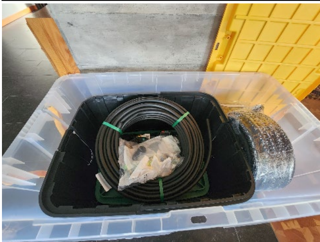
La Conner School Rain Garden Irrigation Kit