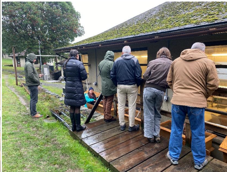
Sea Star lab tour during MRC retreat.