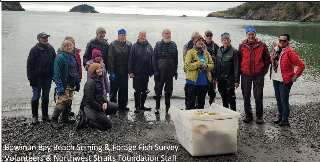
Bowman Bay Beach Seining & Forage Fish Survey Volunteers & Northwest Straits Foundation Staff