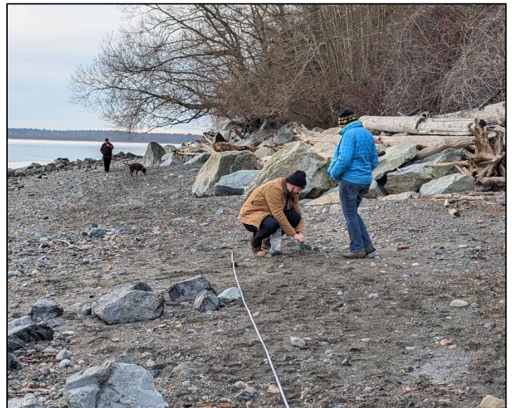
Left: Tons of large woody debris washed up at Little Squalicum Beach following major floods in December. Right: Volunteers conduct a forage fish survey at Little Squalicum Beach.