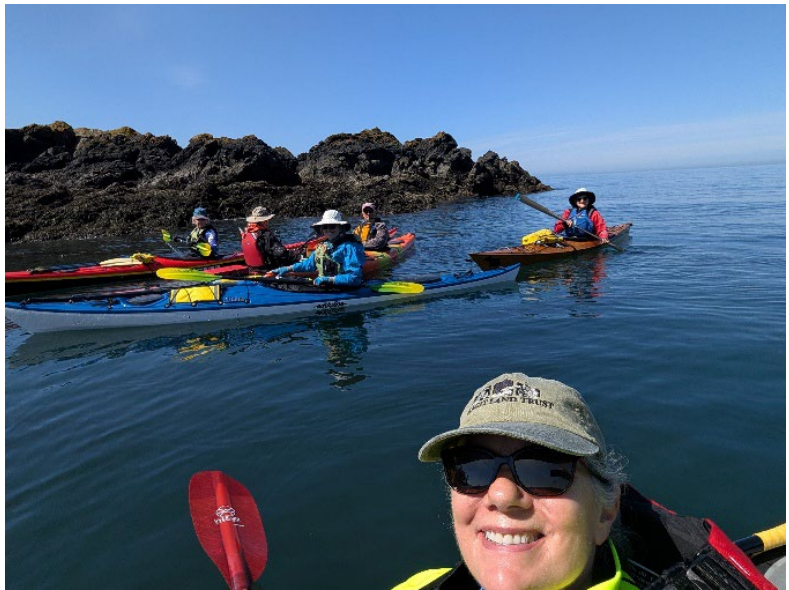
Right: Bowman Bay shakedown cruise